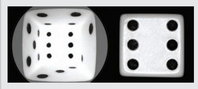
Images of dice using a Hypercentric Lens (left) and a Fixed Focal Length Lens (right)