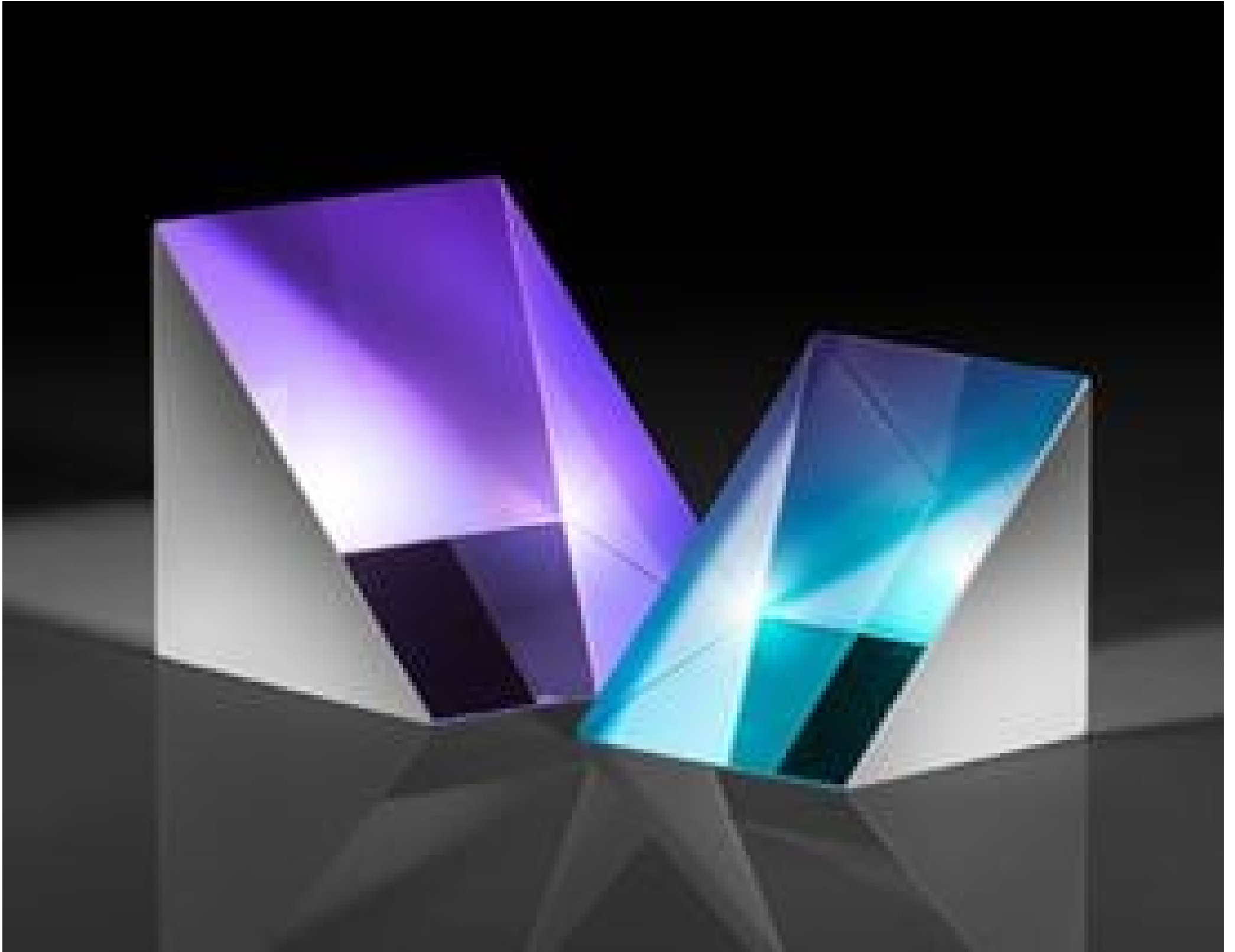
N-BK7 Right Angle Prisms