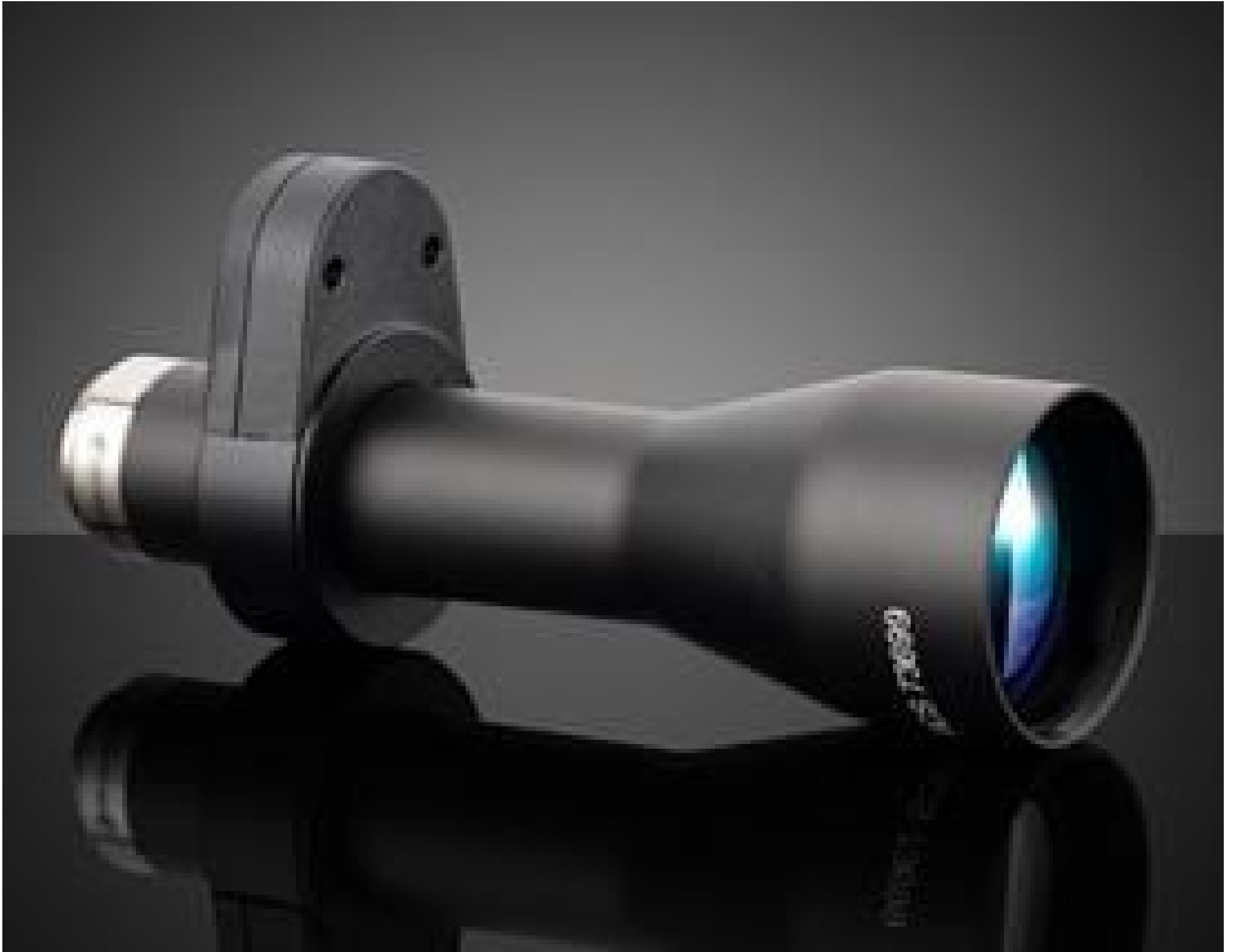
0.25X MercuryTL™ Liquid Lens Telecentric Lens