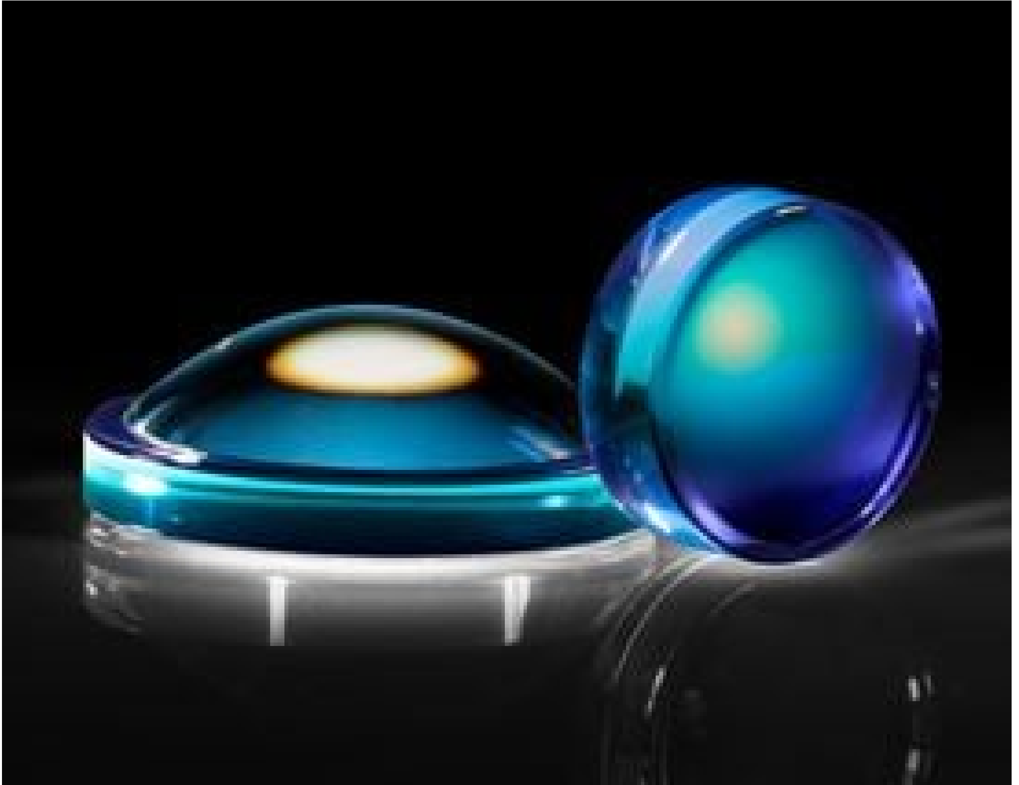
Precision Molded Aspheric Lenses