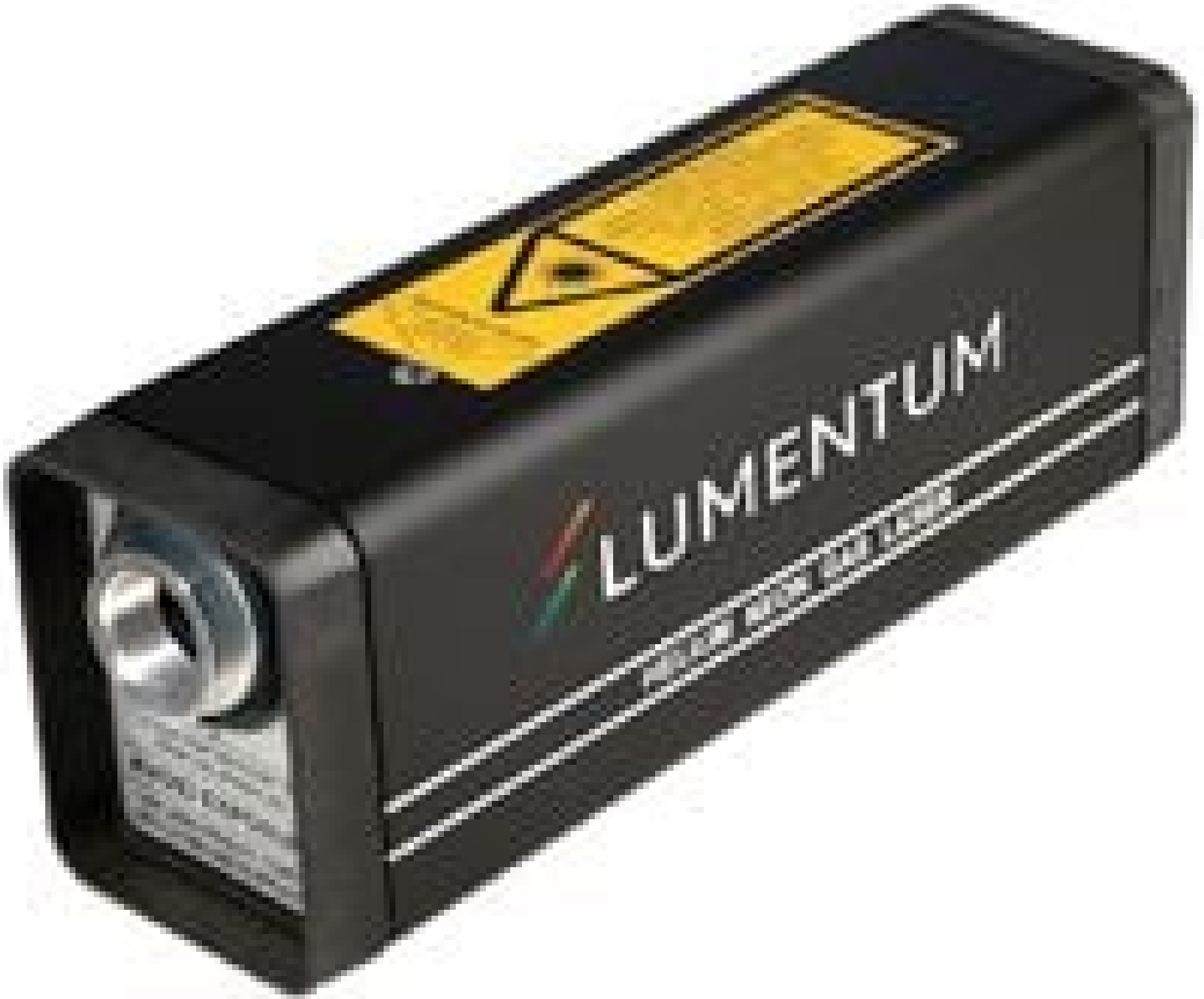
Low-Noise Lumentum Helium-Neon Laser with self-contained power supply