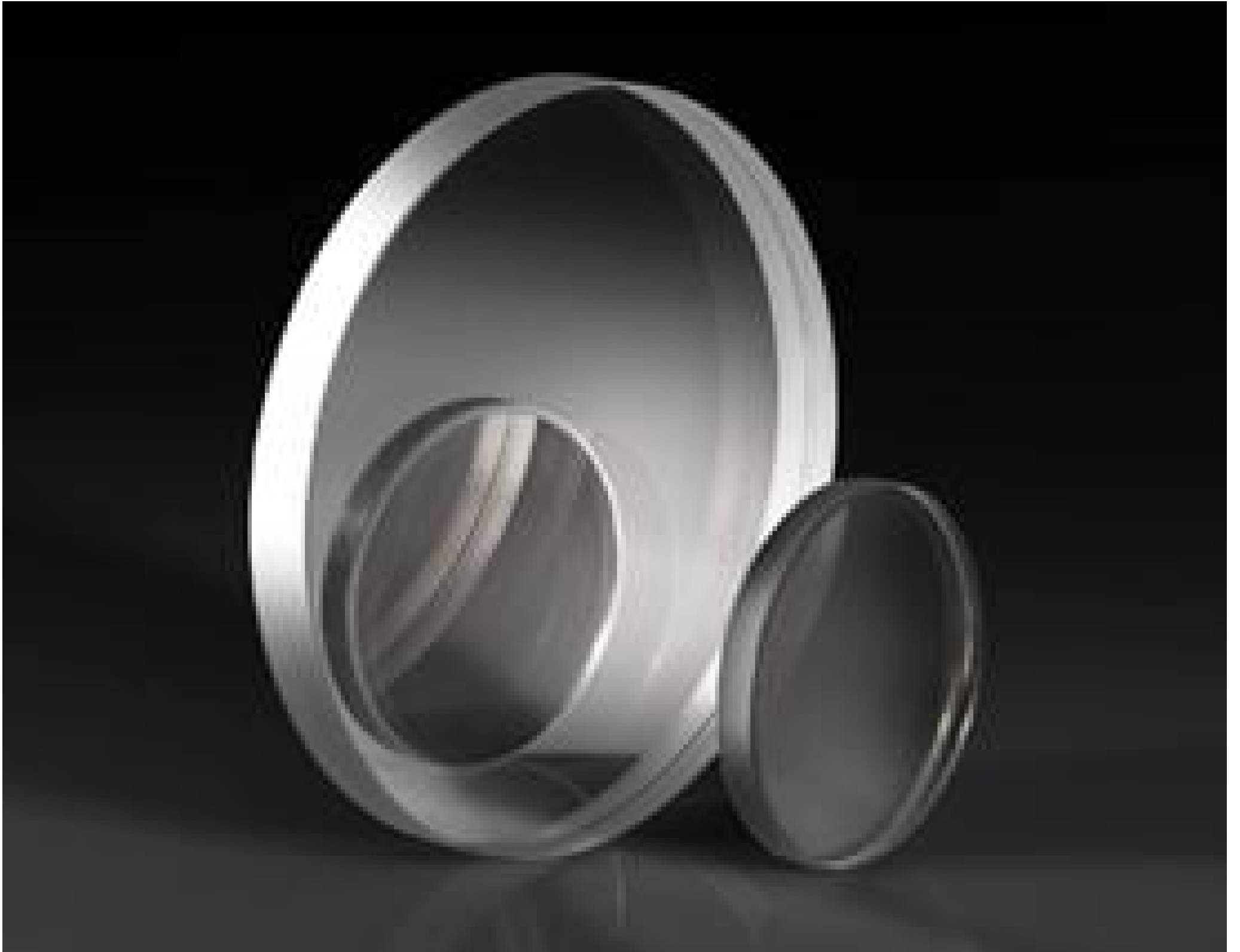
UV-NIR Neutral Density Filters