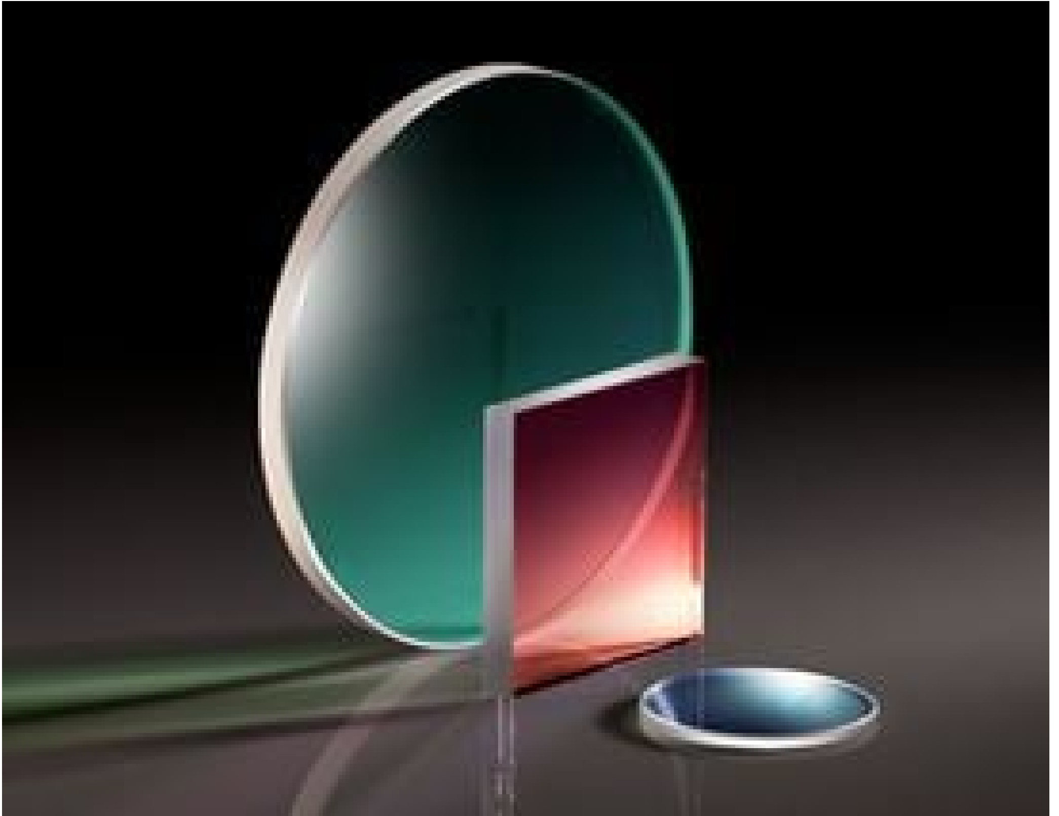
TECHSPEC High Performance Hot Mirrors