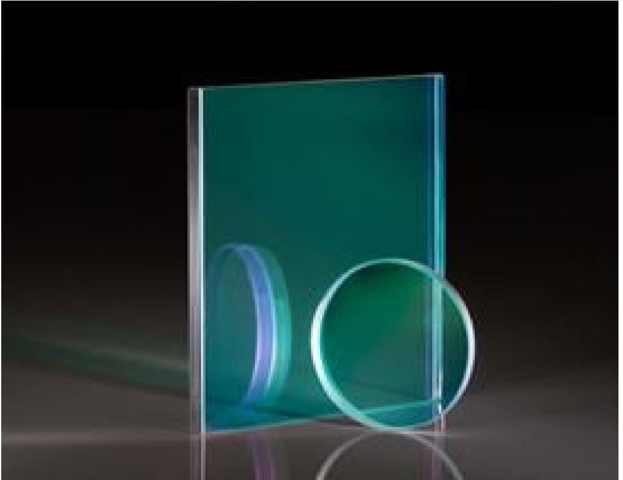
UV Hot Mirrors