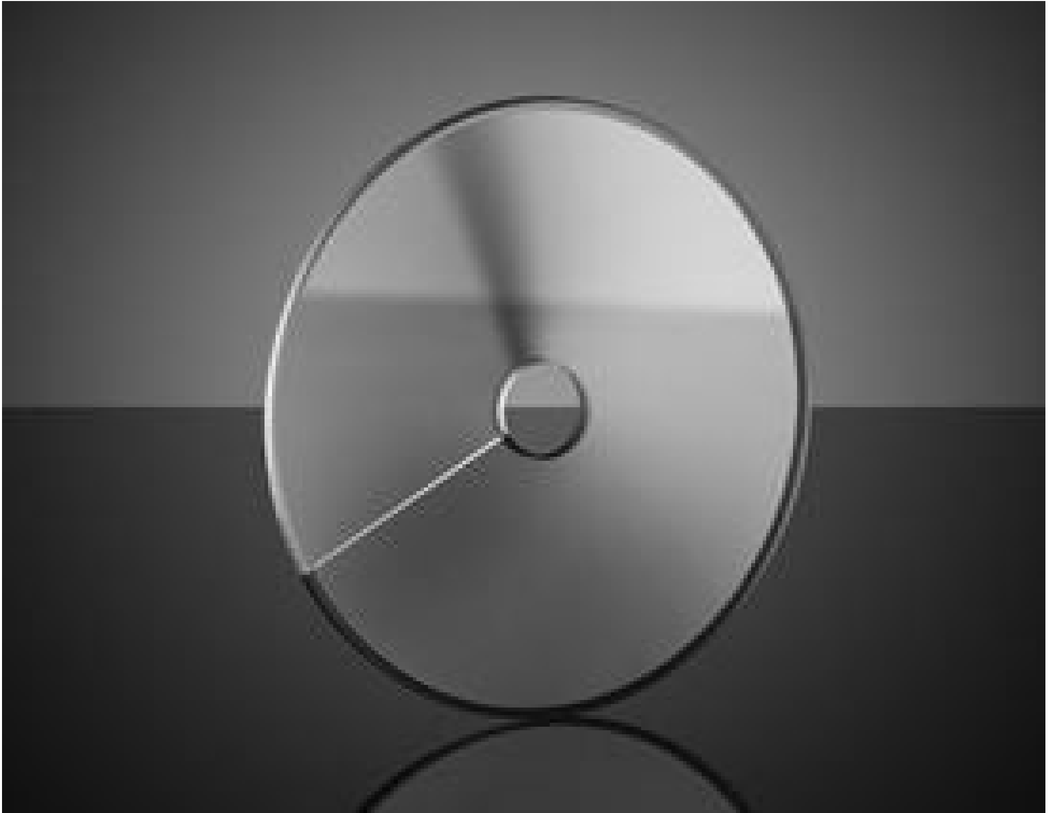
Unmounted Circular Variable Neutral Density (ND) Filters