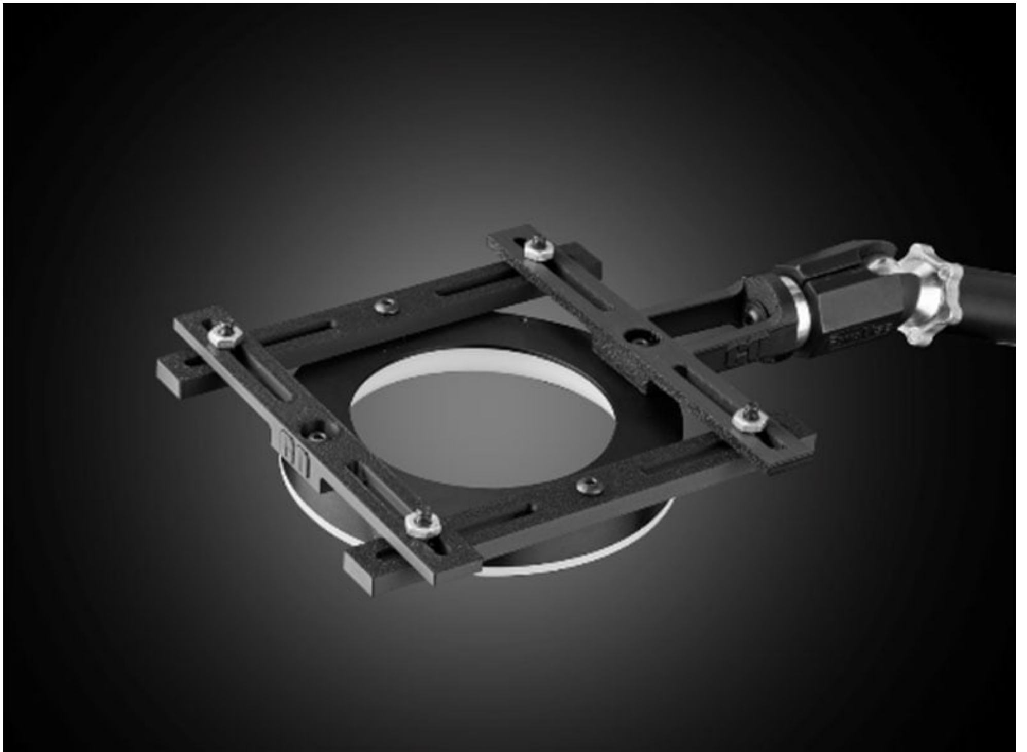
Ring Light Configuration