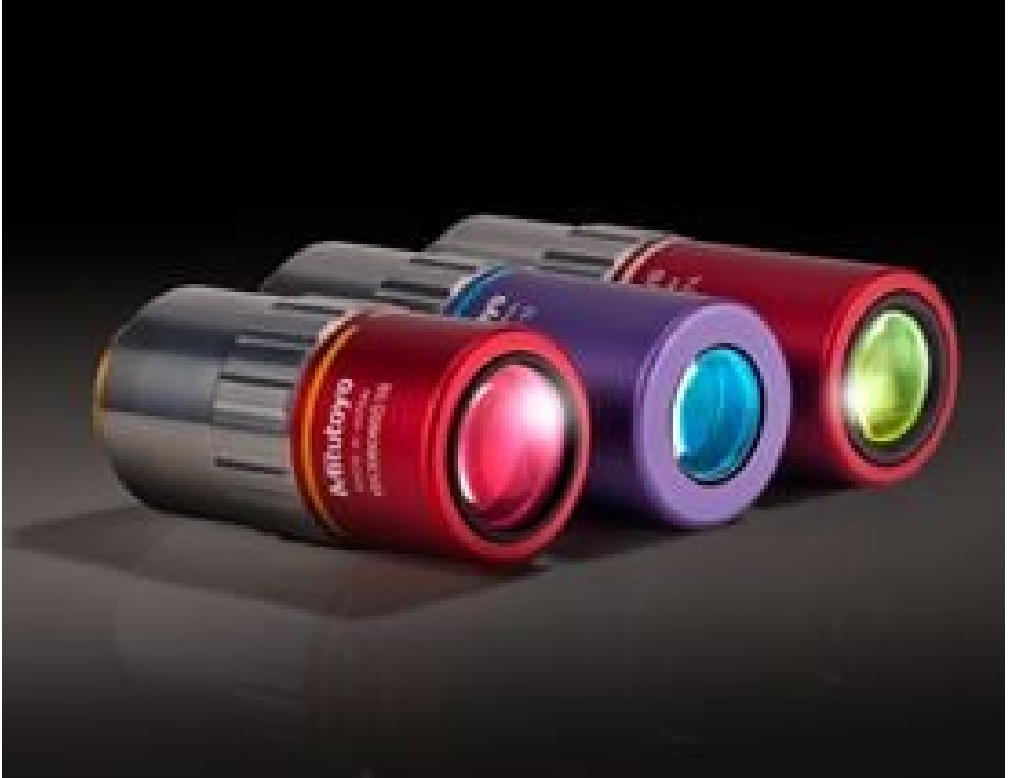
Mitutoyo NIR, NUV, and UV Infinity Corrected Objectives