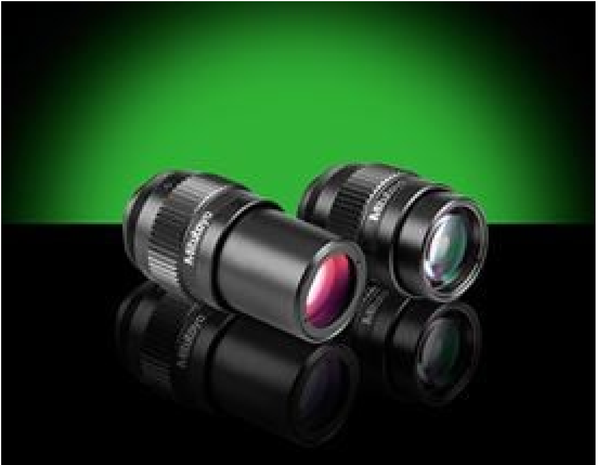
3X (#56-985) & 5X (#56-986)