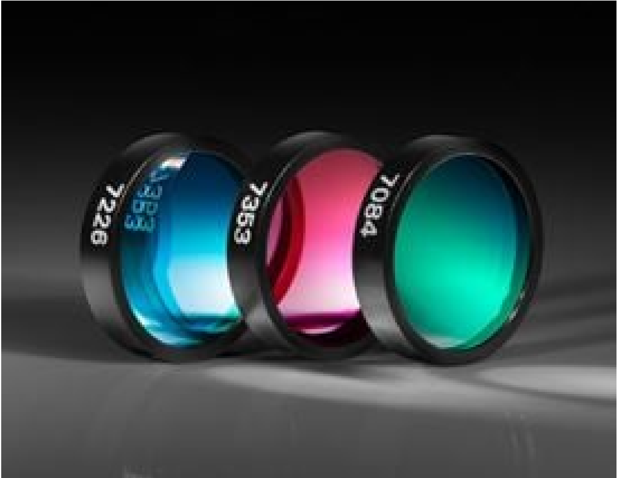
Ultra Narrow Bandpass Filters