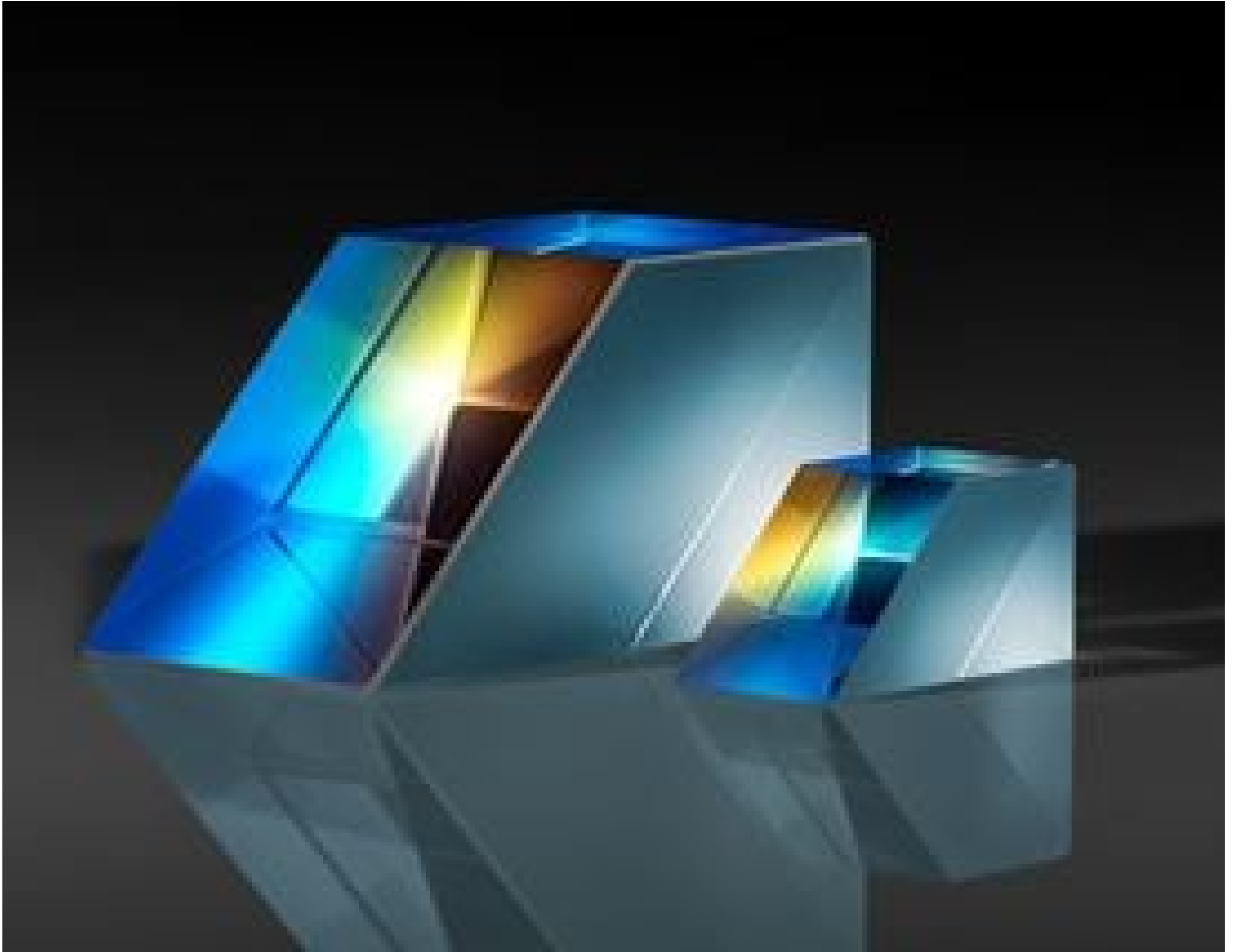
Lateral Displacement Beamsplitters