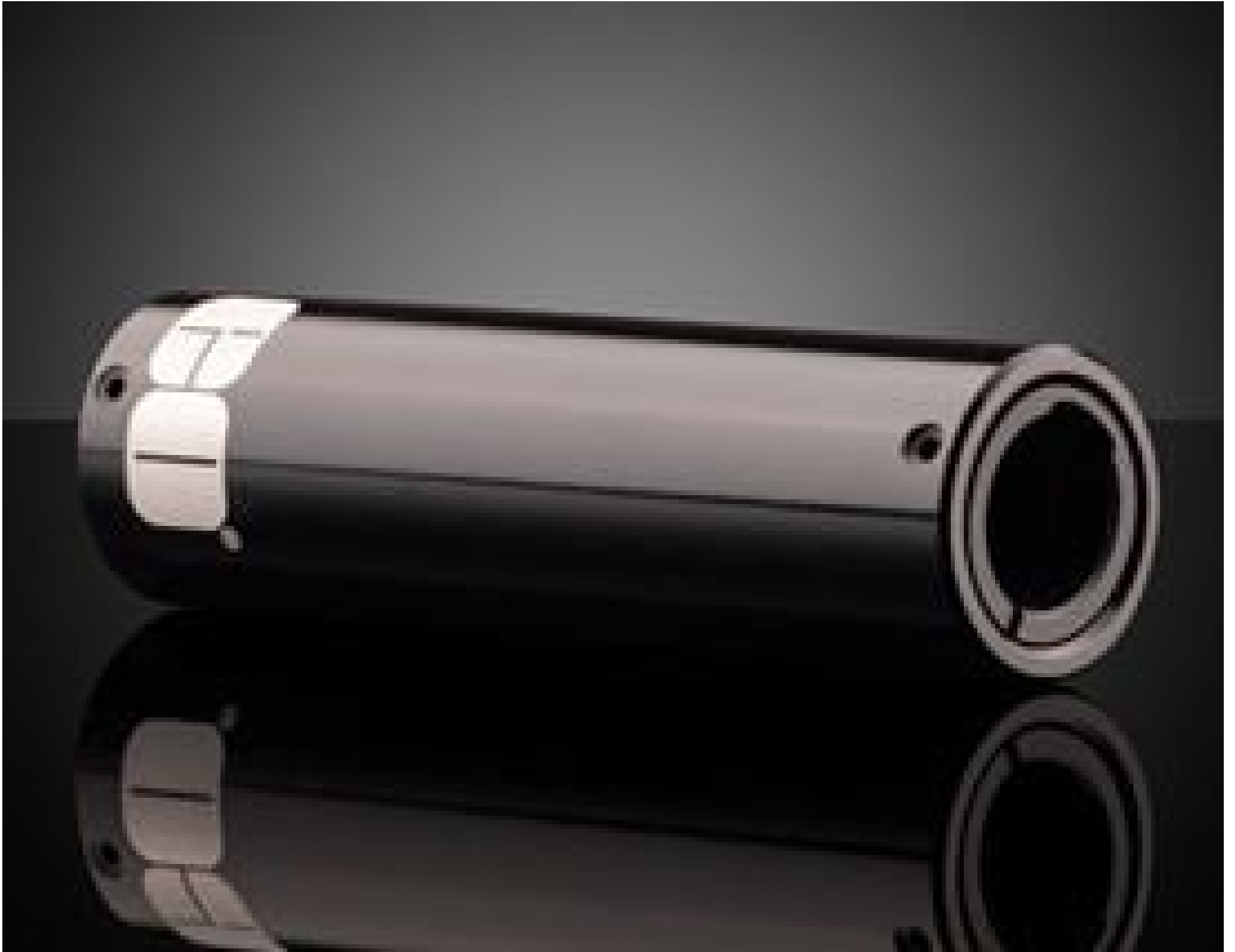
10mm Aperture, 75mm Length, Light Pipe Homogenizing Rod Mount, #64-919