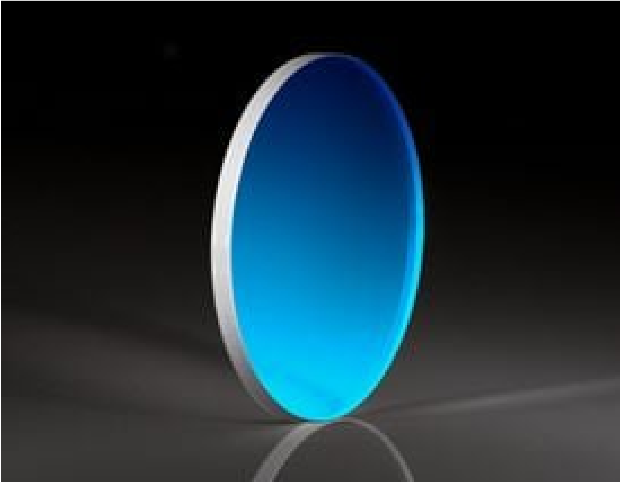
Uncoated \lambda /20 Fused Silica Window