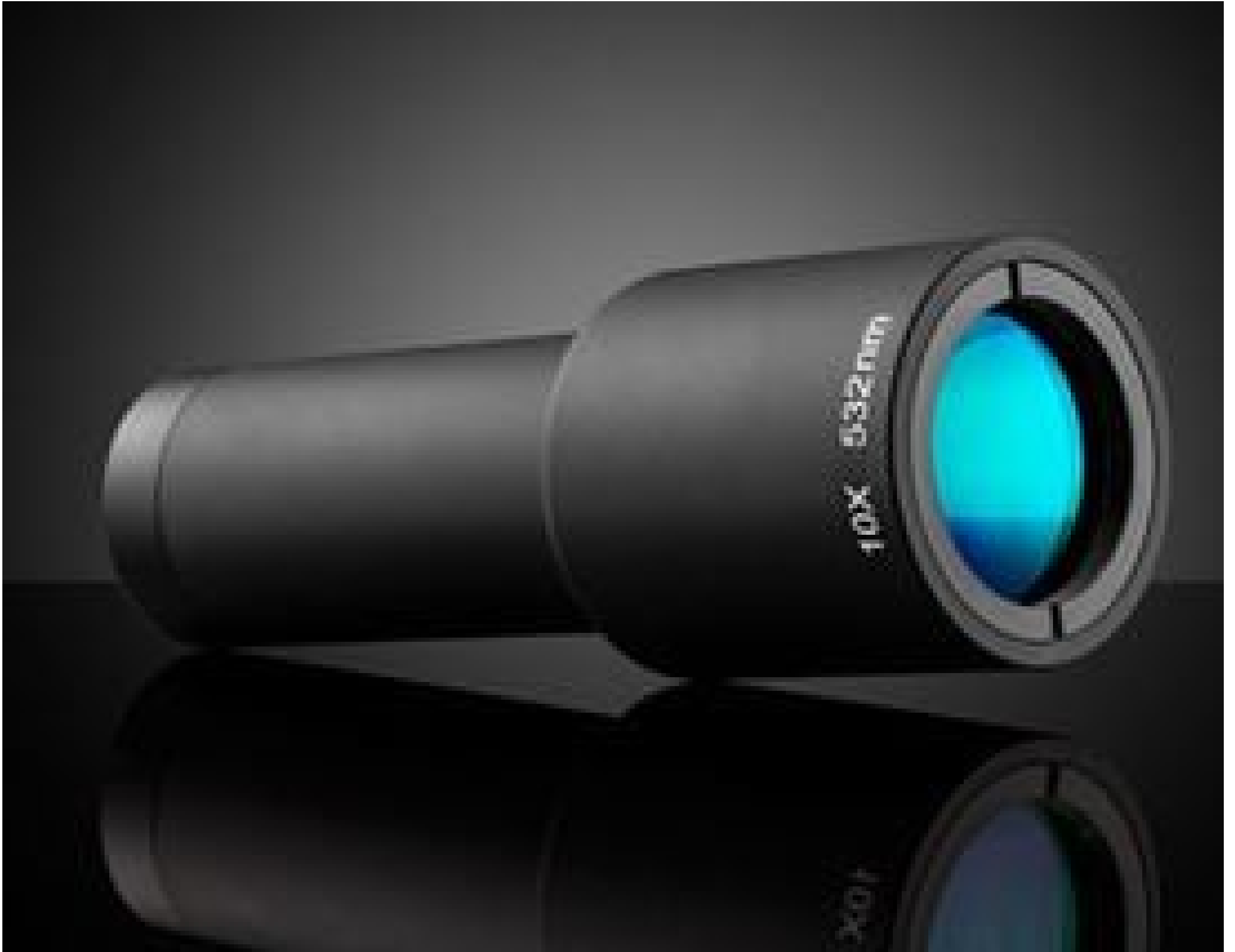
10X, 532nm Lcht Fixed YAG Beam Expander, #37-068