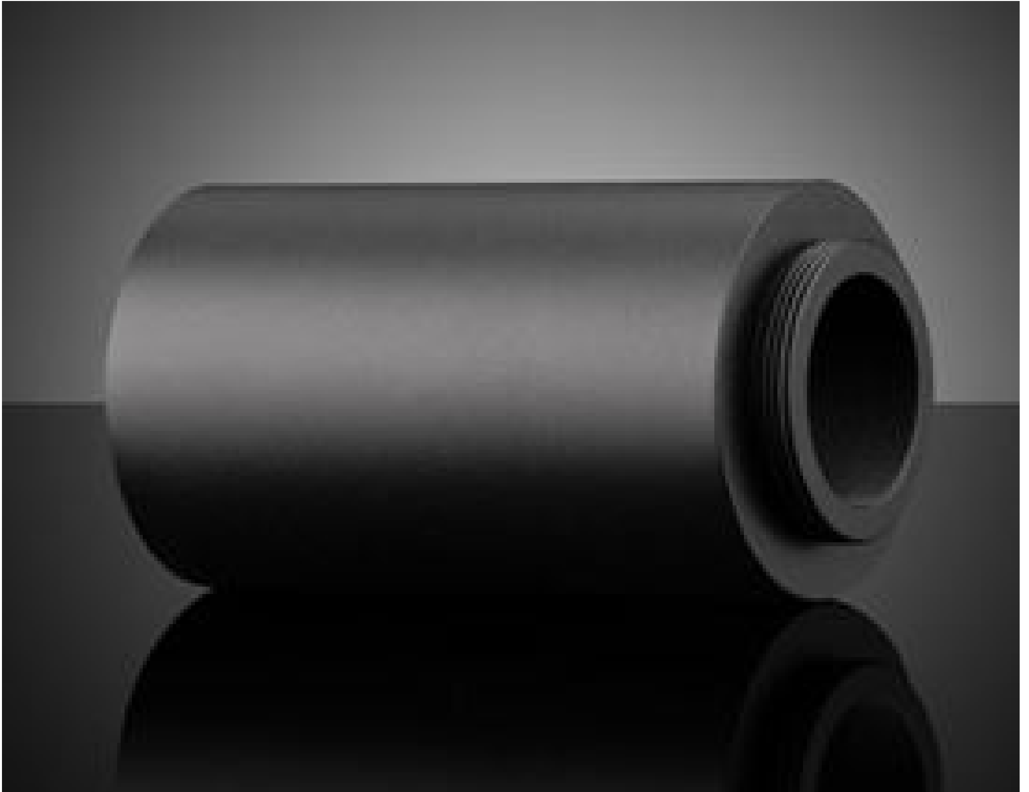
#23-901, 5X, 95mm, C-Mount Parfocal Adapter