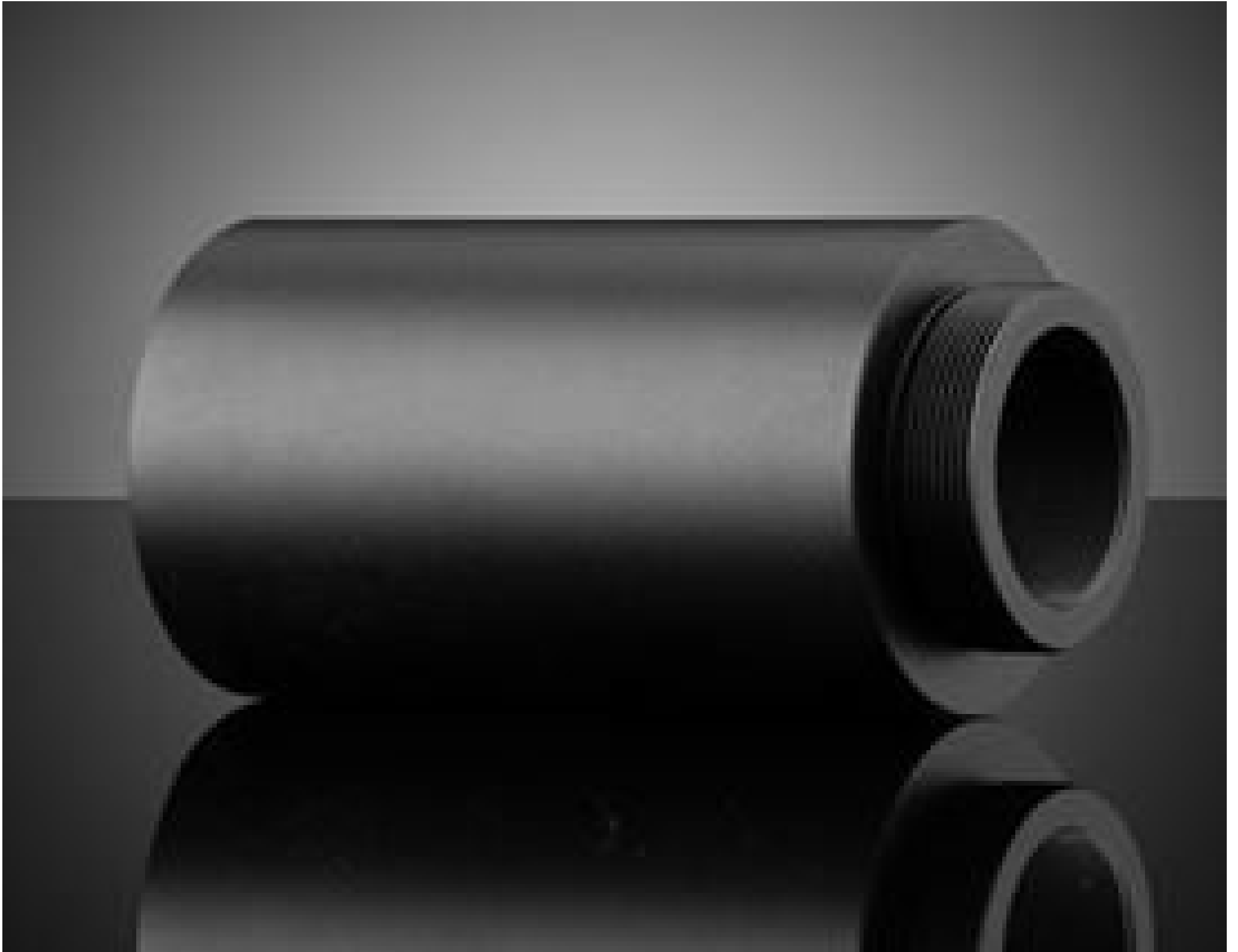
#24-218: 5X, 95mm M26 Parfocal Adapter