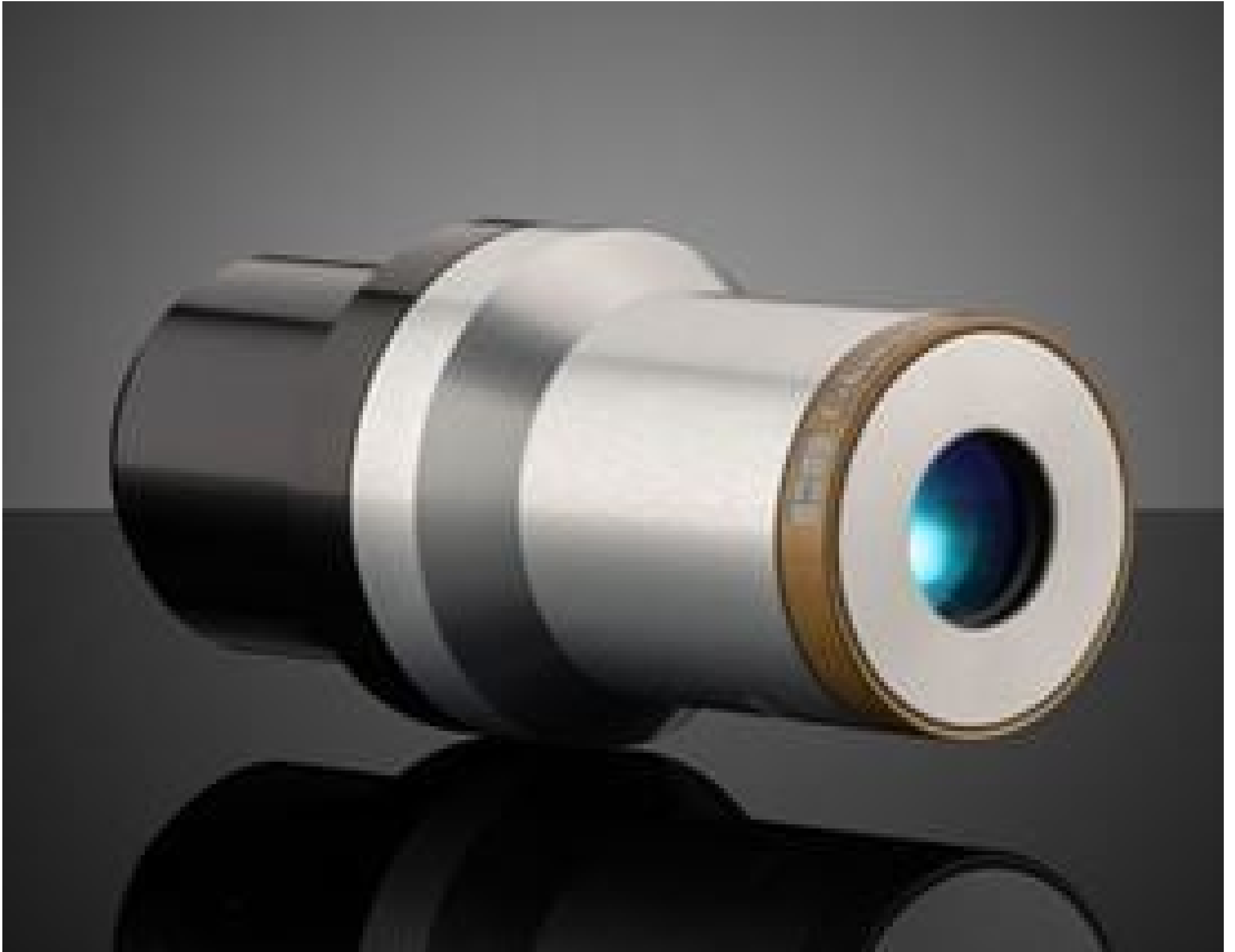
#88-354: 10XCf Objective