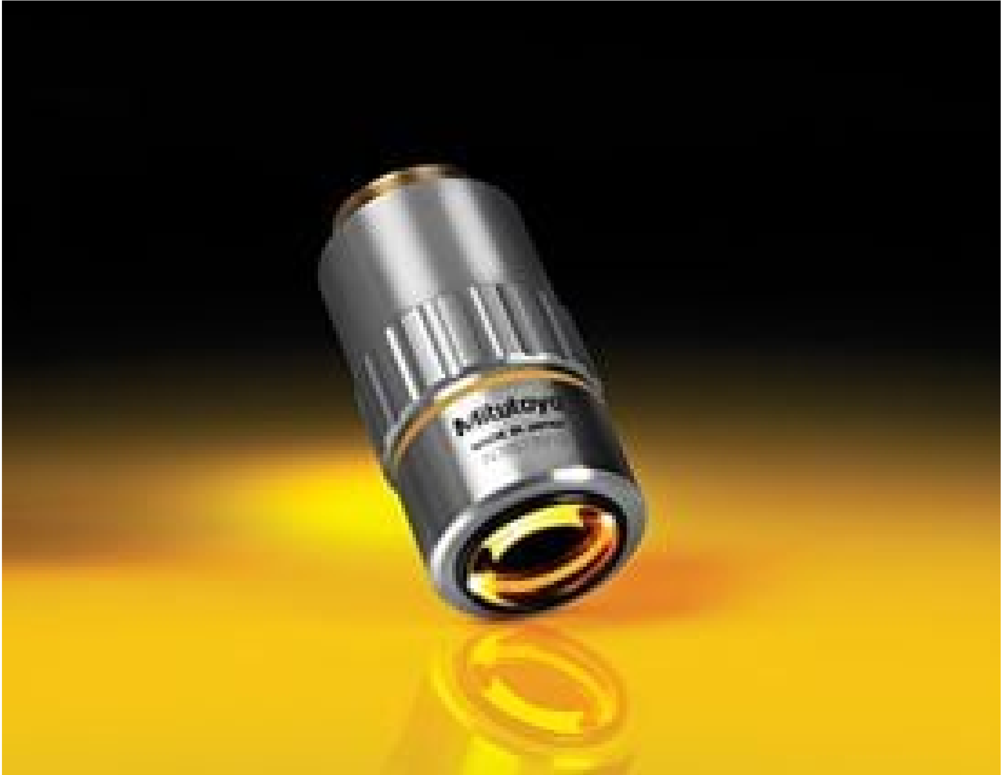
10X Mitutoyo Plan Apo Infinity Corrected Long WD Objective, #46-144