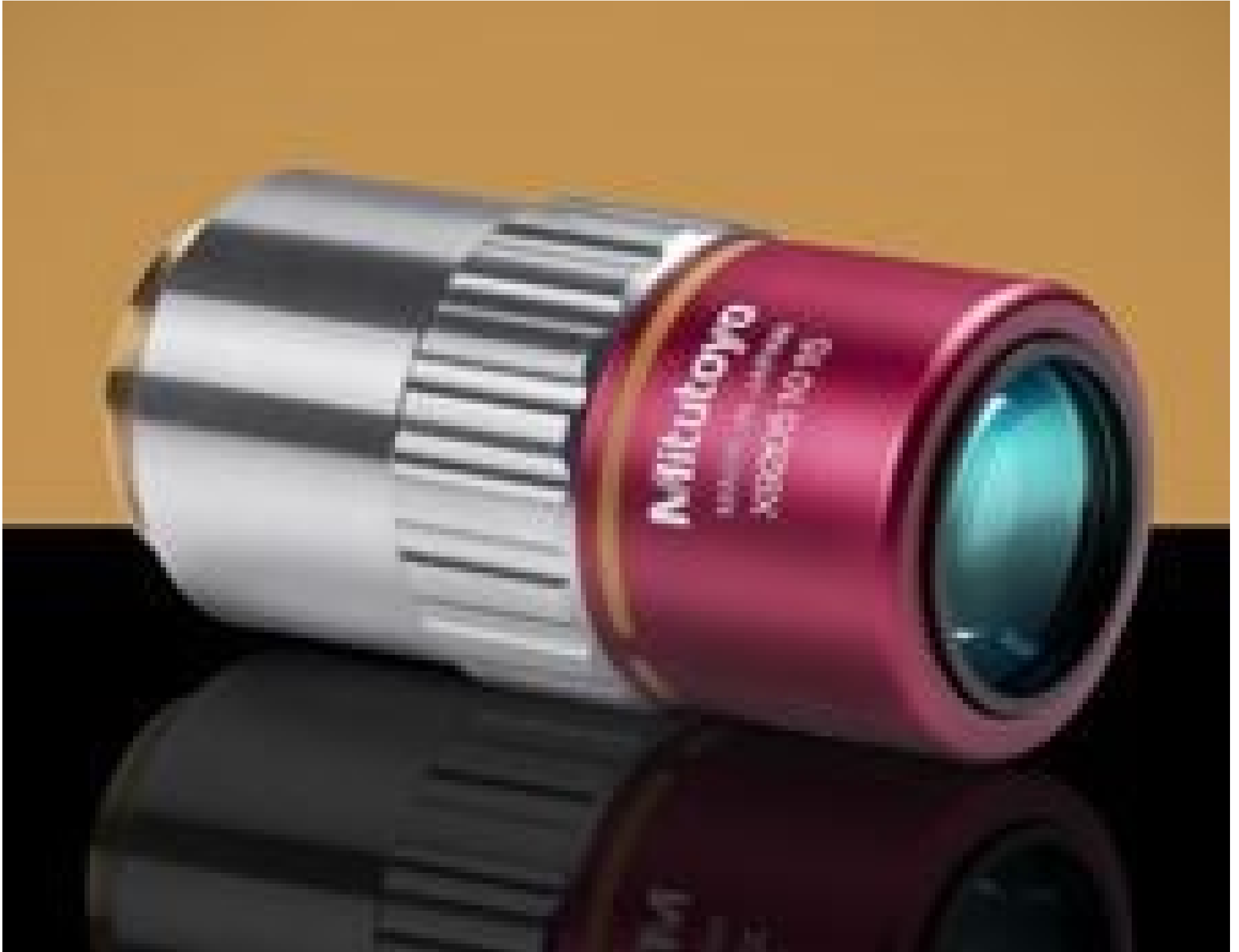
10X Mitutoyo Plan Apo NIR Infinity Corrected Objective, #46-403