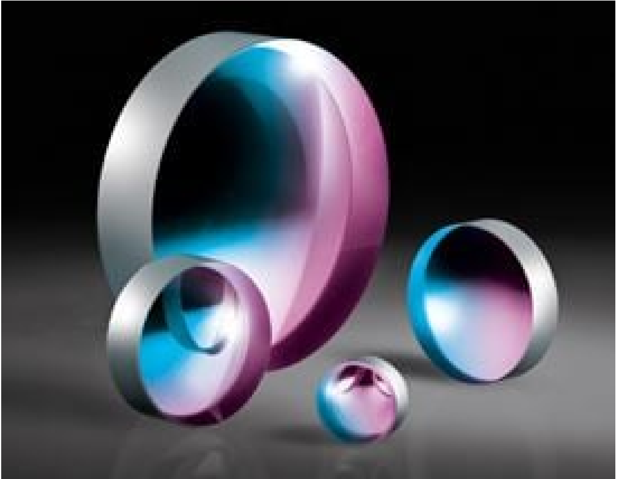
UV Fused Silica Plano-Concave (PCV) Lenses