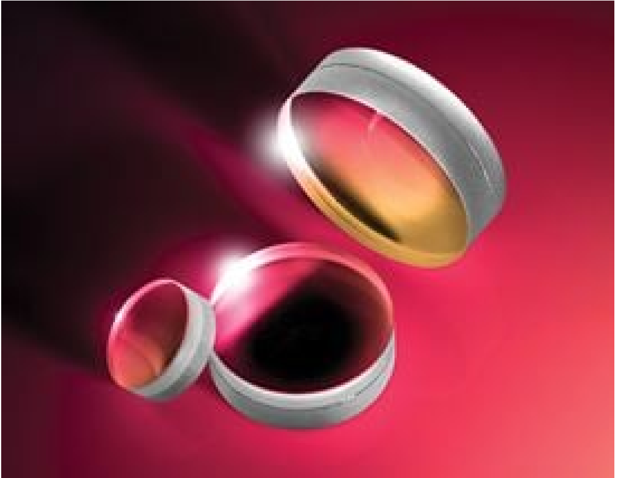
YAG-BBAR Coated Achromatic Lenses