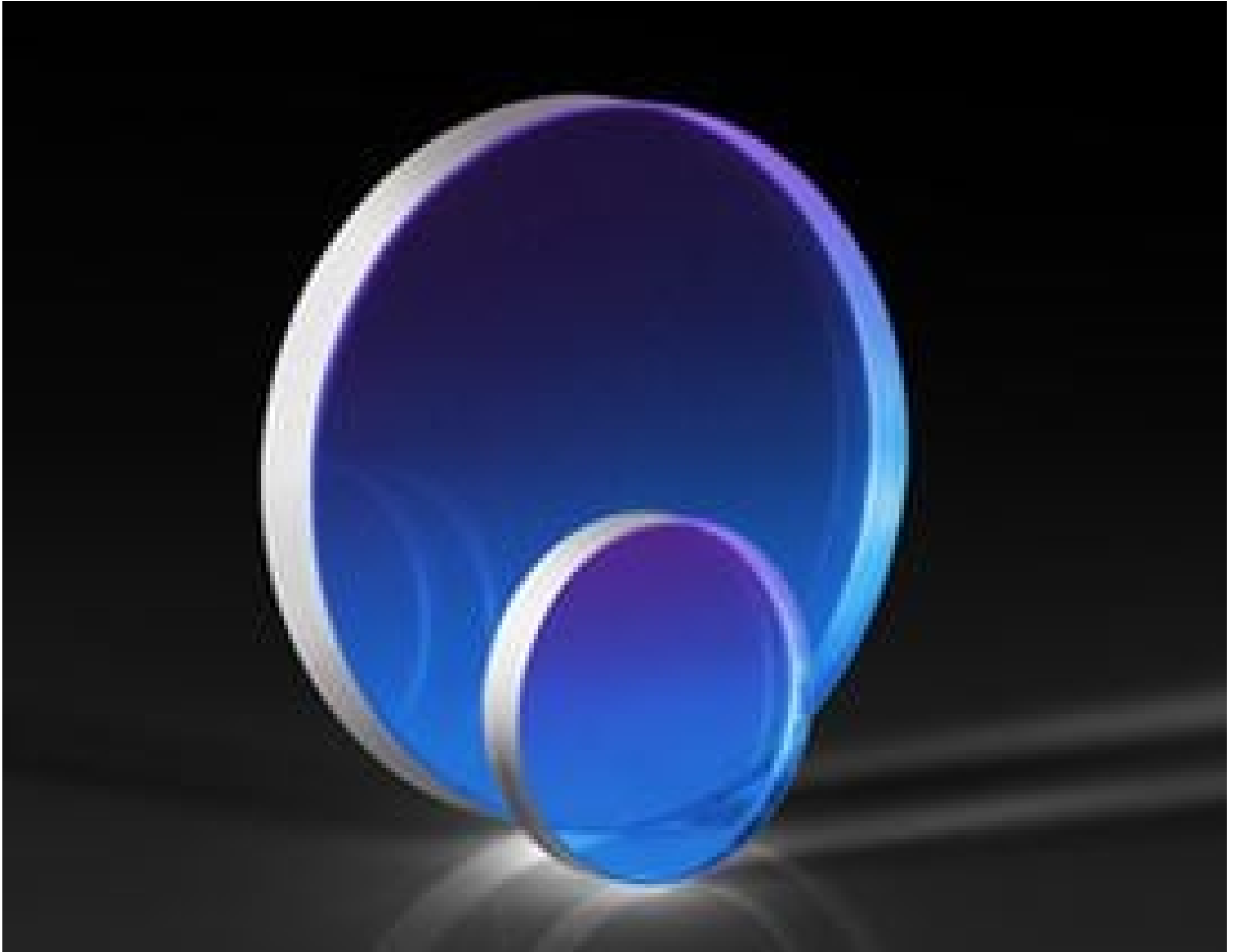
Magnesium Fluoride (MgF 2 ) Windows