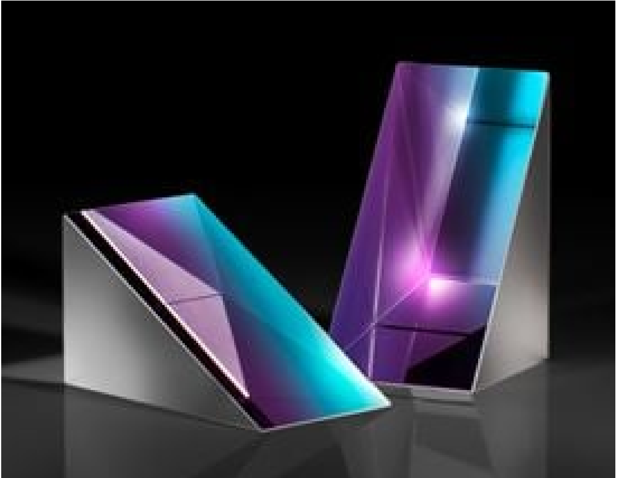
30° - 60° - 90° Littrow Dispersion Prisms