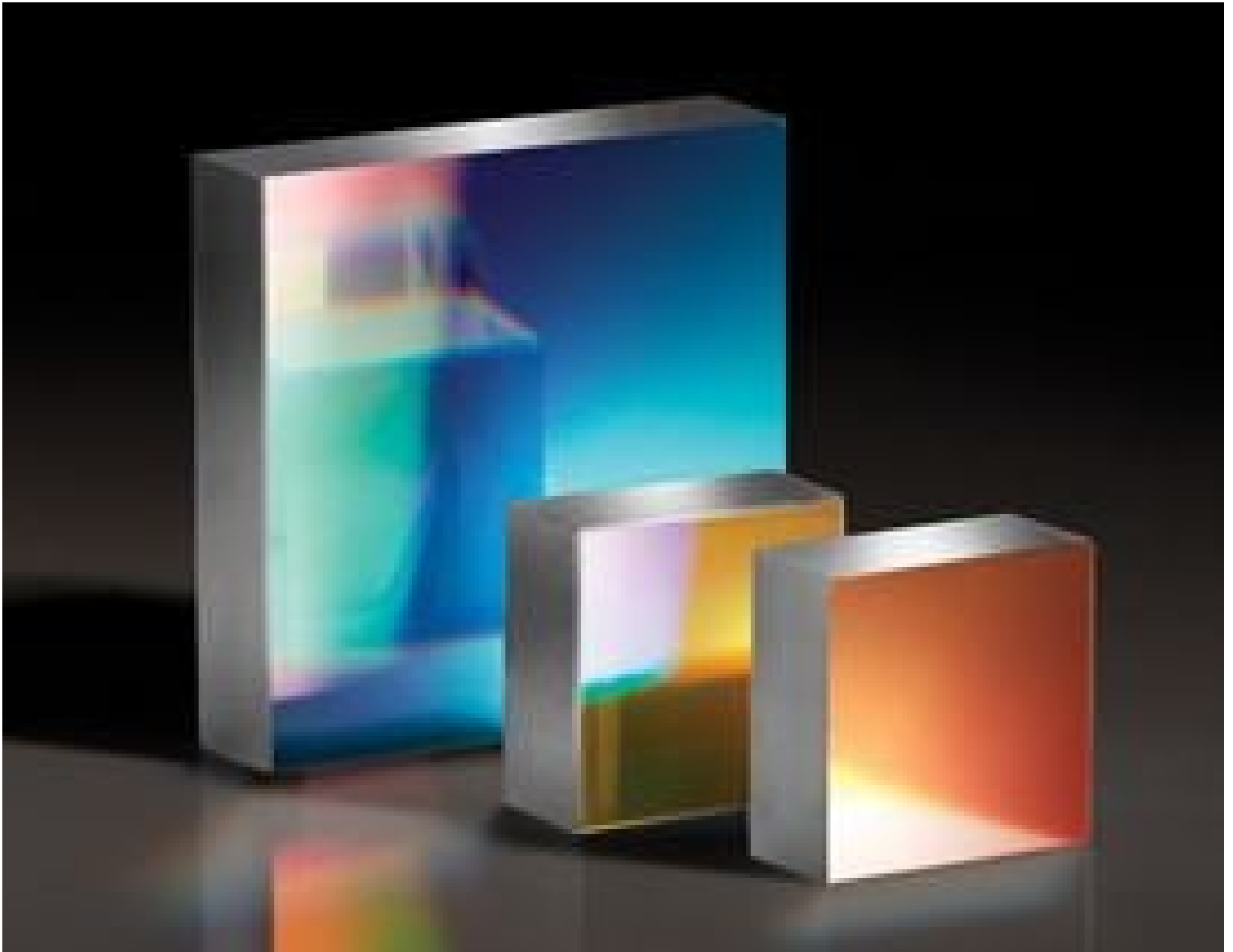
Richardson Gratings™ High Precision Plane Ruled Reflective Diffraction Gratings