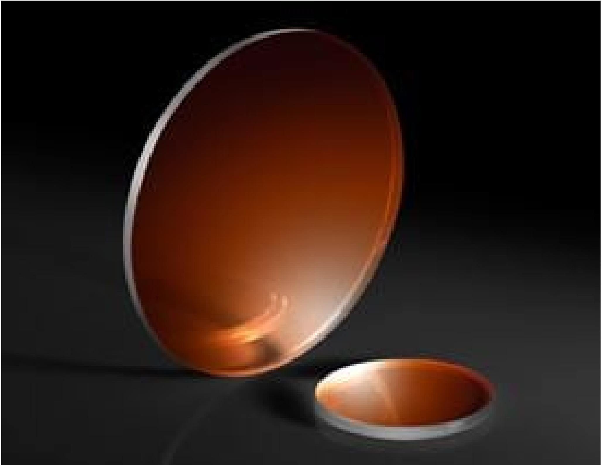
Lithium Fluoride (LiF) Windows