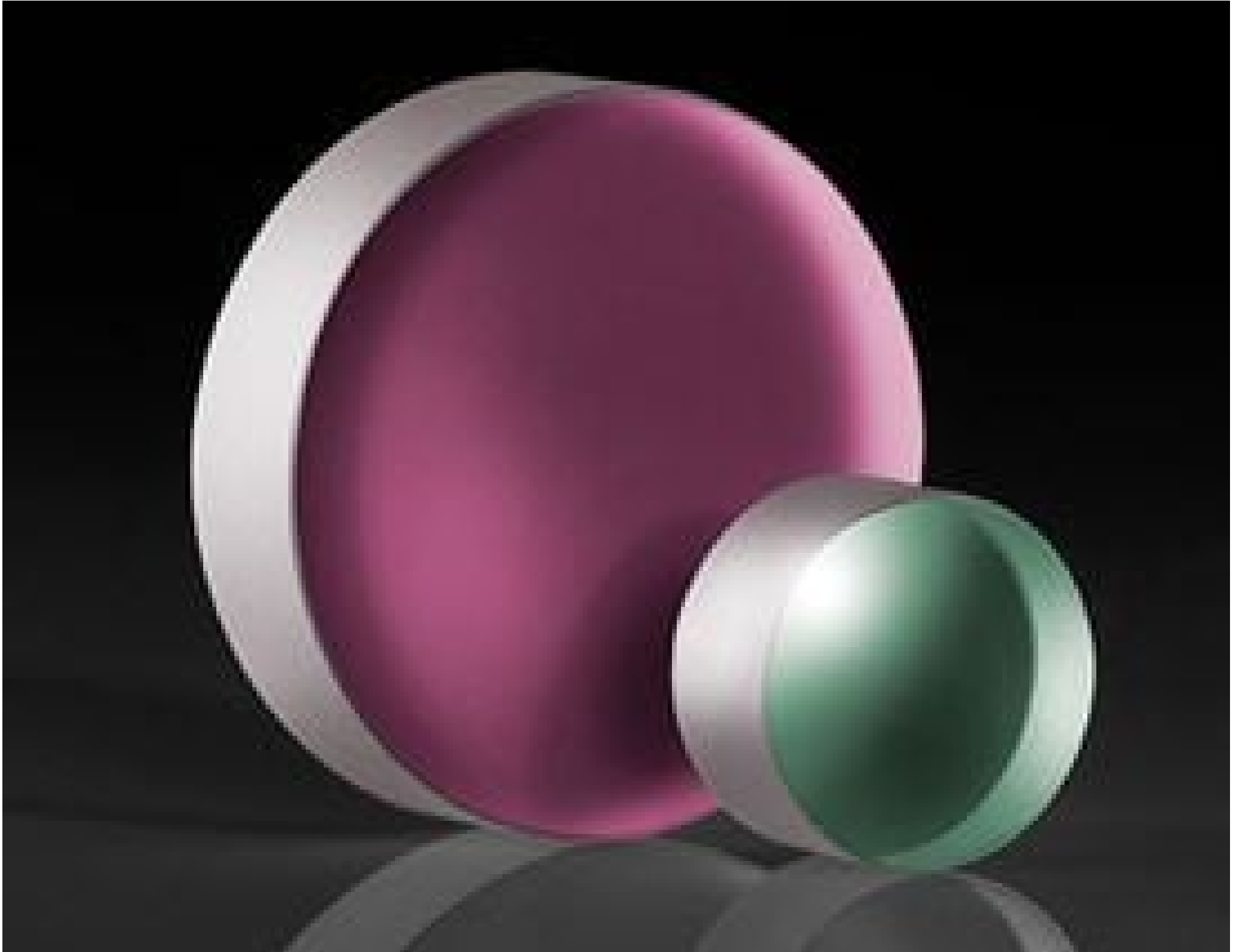
UltraFast Innovations (UFI) 800nm Highly-Dispersive Ultrafast Mirrors