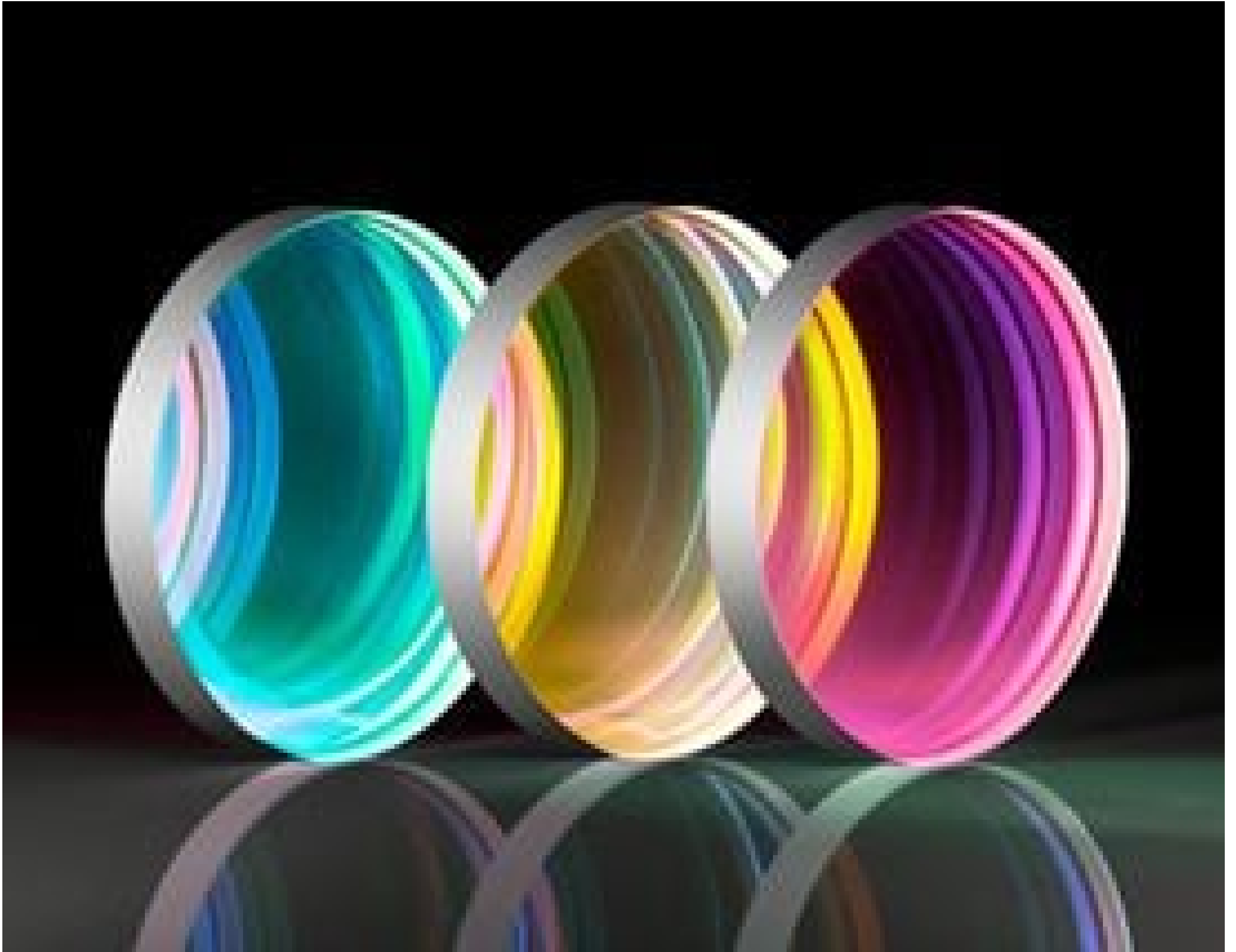
TECHSPEC® Ultrafast Beamsplitters