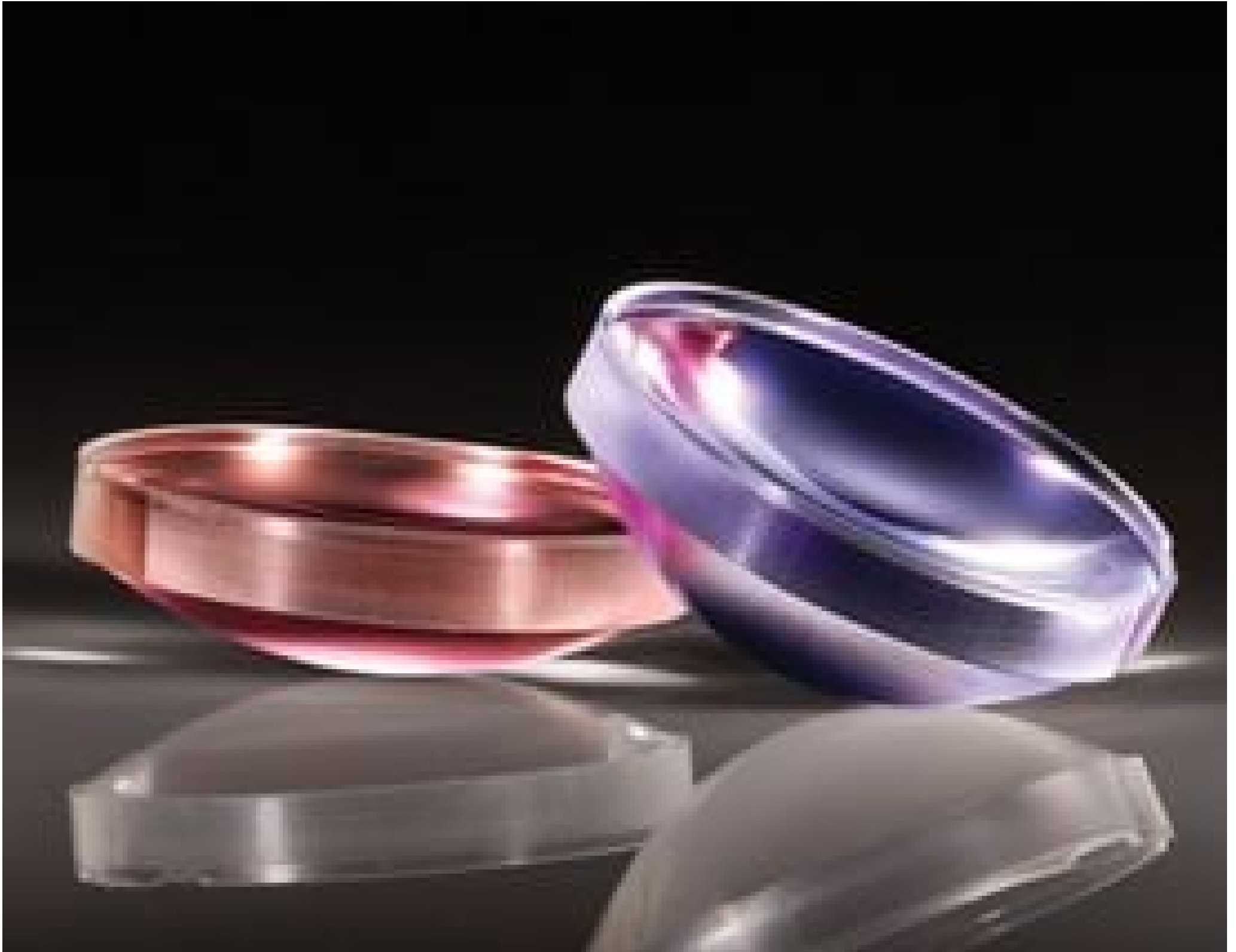
TECHSPEC® Plastic Hybrid Aspheric Lenses