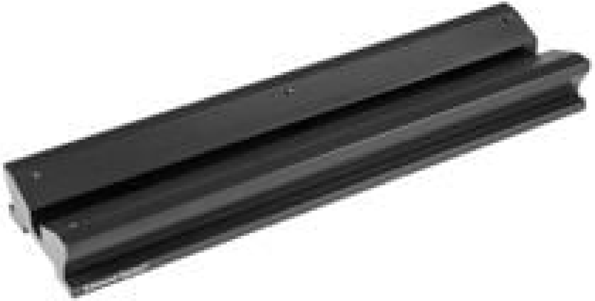
12" Length, Dovetail Optical Rail, #54-401