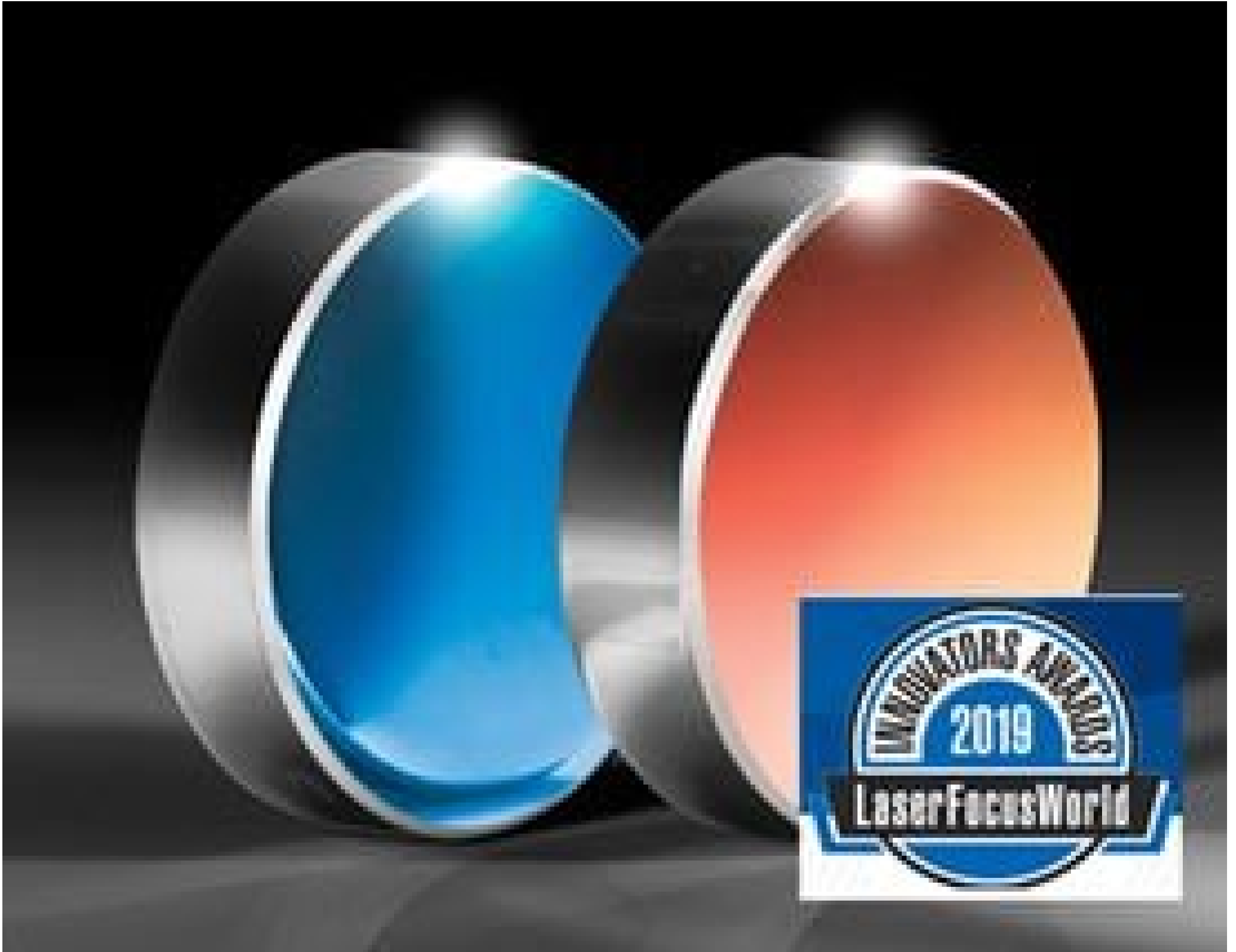
Extreme Ultraviolet (EUV) Flat Mirrors