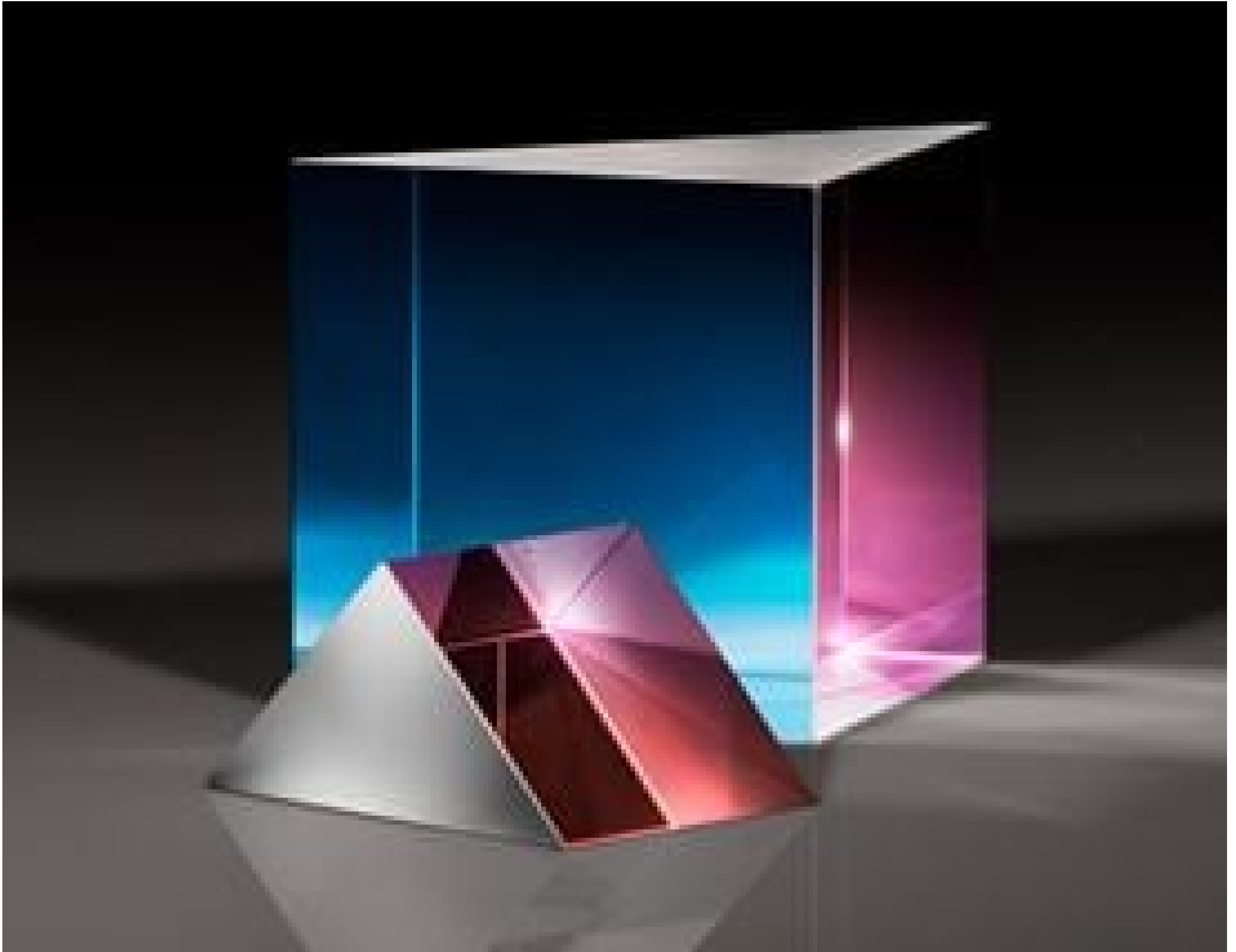
TECHSPEC High Tolerance UV Fused Silica Right Angle Prisms