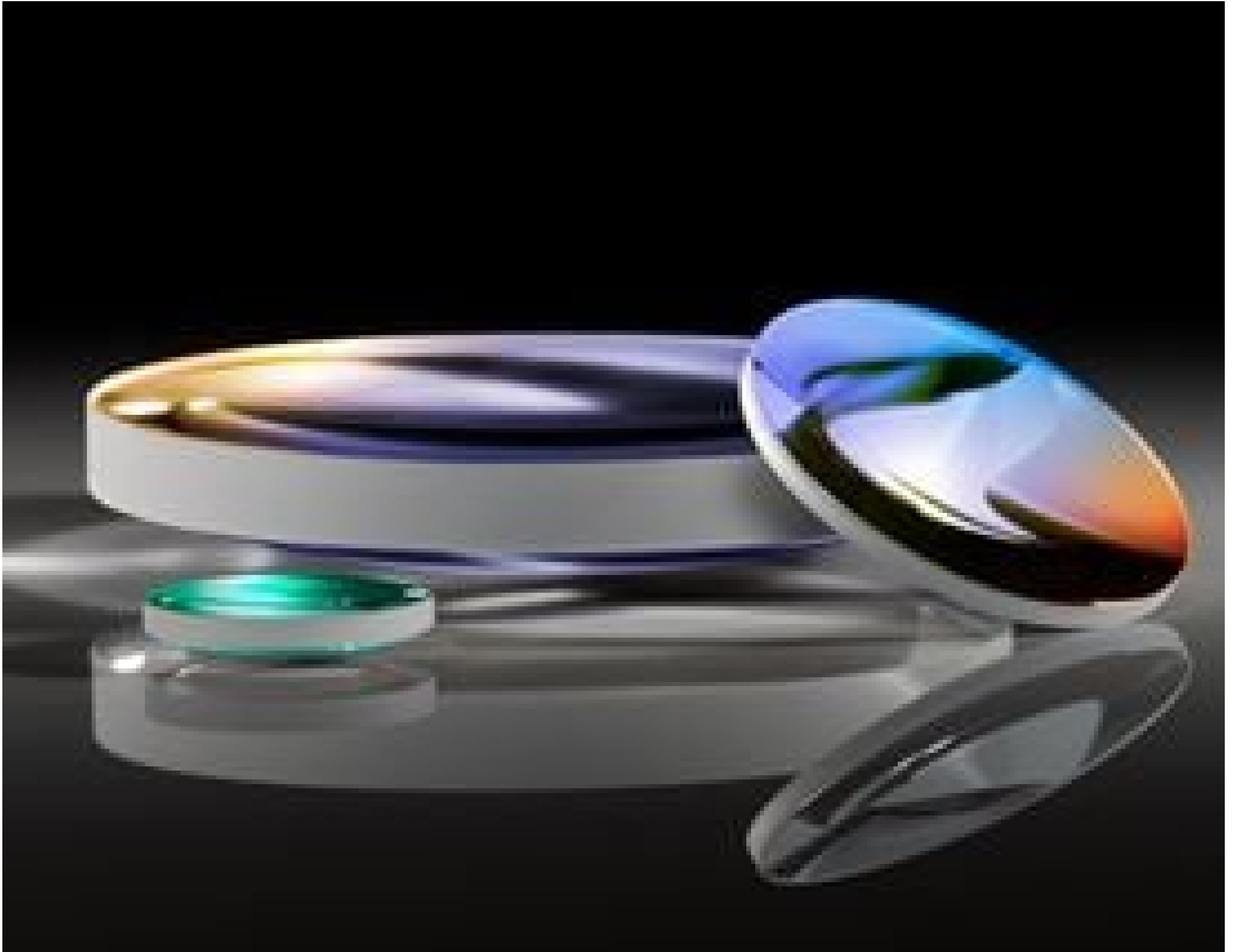
YAG-BBAR Coated Plano-Convex (PCX) Lenses