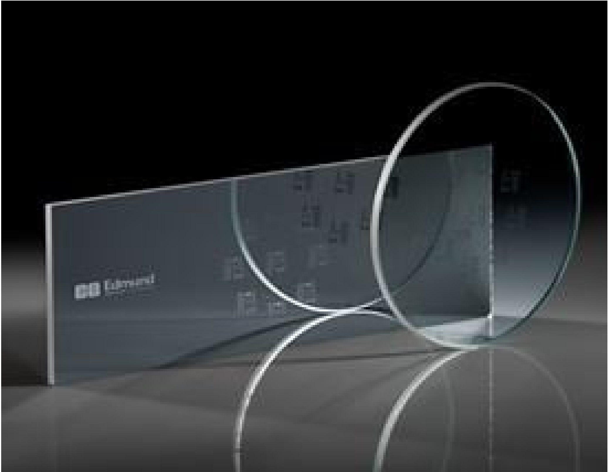
USAF Pattern Wheel Targets