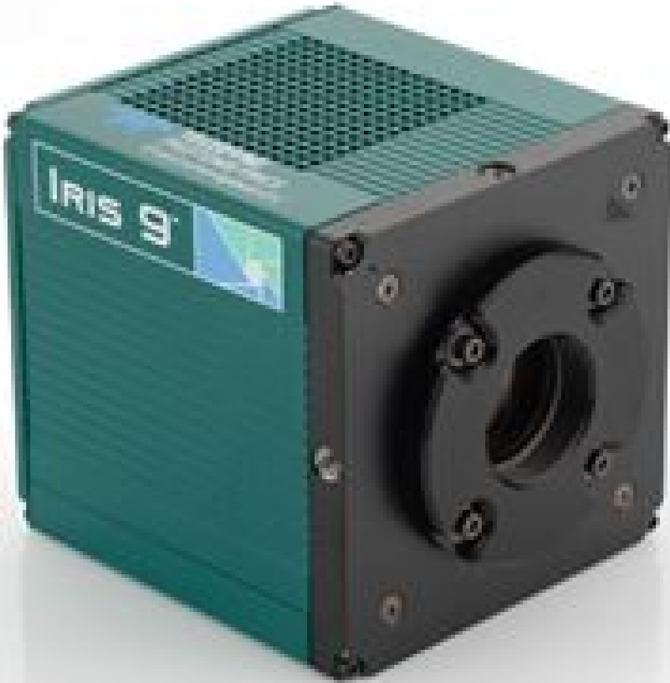
#90-392 Photometrics Iris 9 PCIe Camera