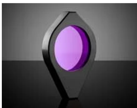
Compact Mirror & Lens Mounts