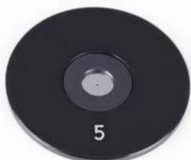
#56-274 - 5µm Aperture Diameter, Mounted, Precision Pinhole A$157.60