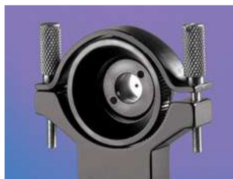
Precision Pinhole Mount