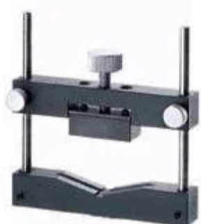
#55-530 - 10.0 - 60.0mm Optic Height, Metric Bar-Type Optic Holder A$172.80