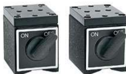
#58-514 - 50mm Square Metric Magnetic Base A$192.00