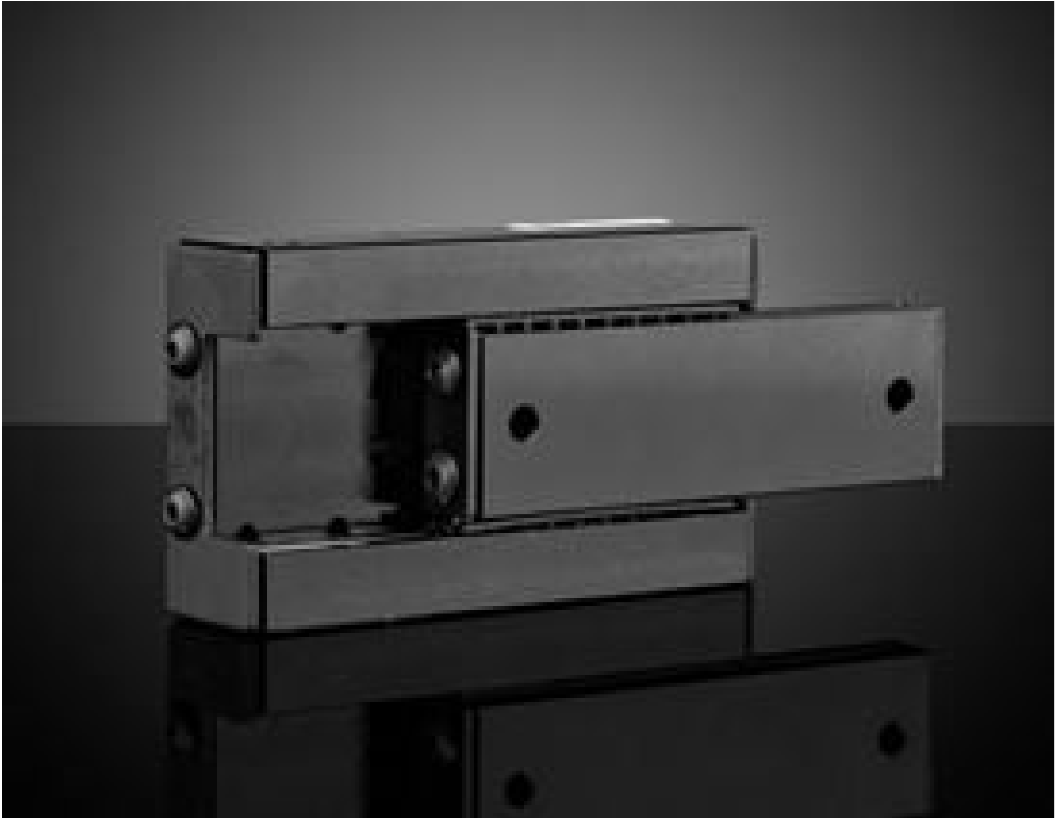
2" Travel, 3"L x 1.75"W Ball Bearing Slide, #37-361