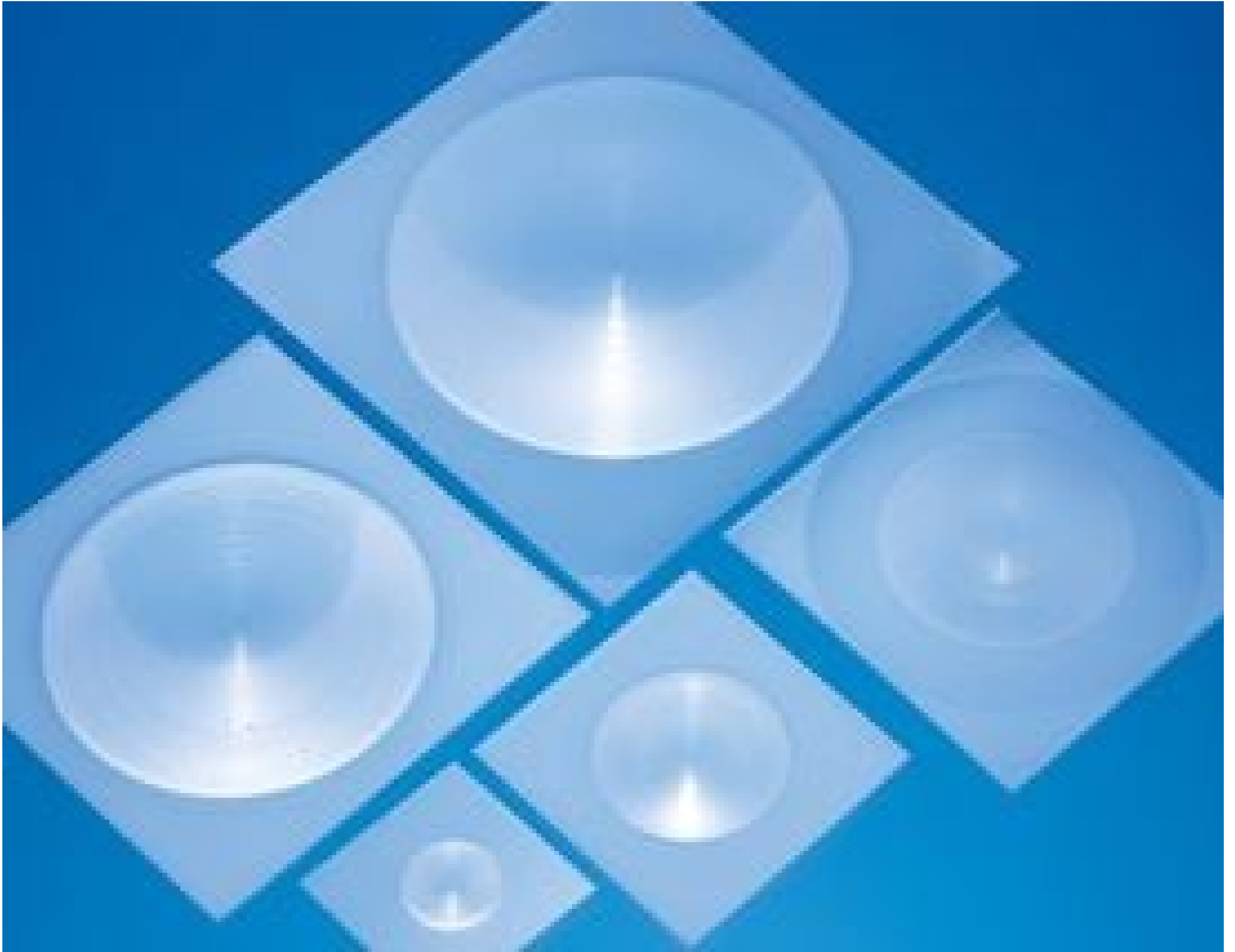
Infrared (IR) Fresnel Lenses