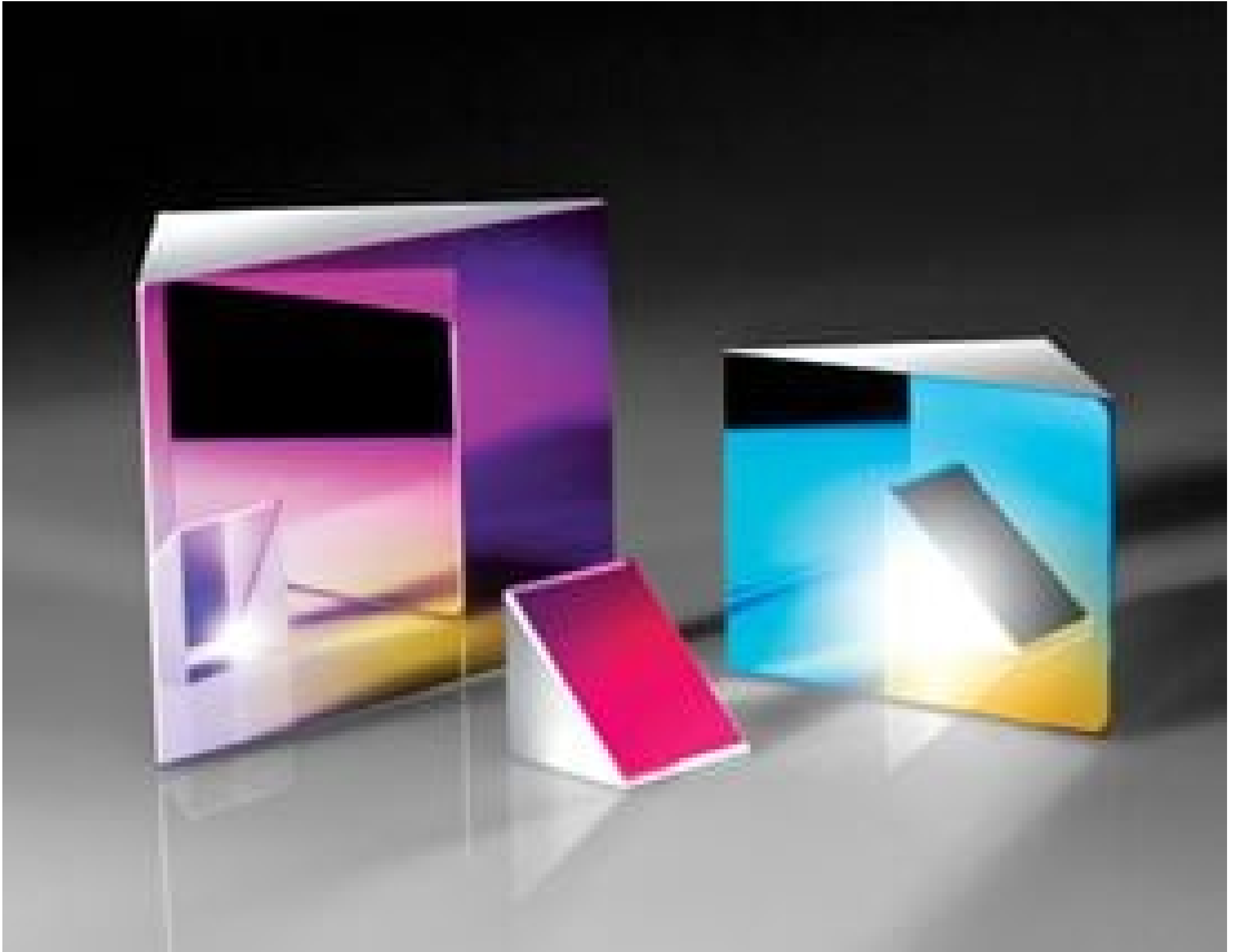
Broadband Dielectric Coated Right Angle Mirrors