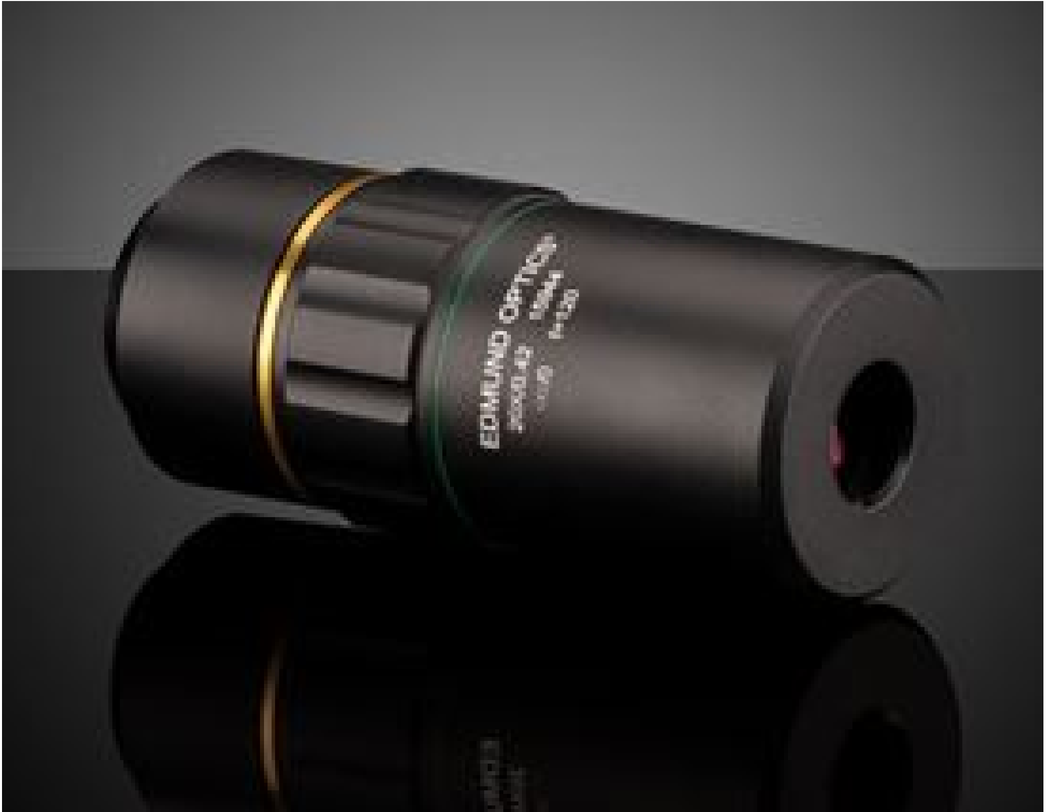
#15-944: 20X 120i Infinity Corrected Objective