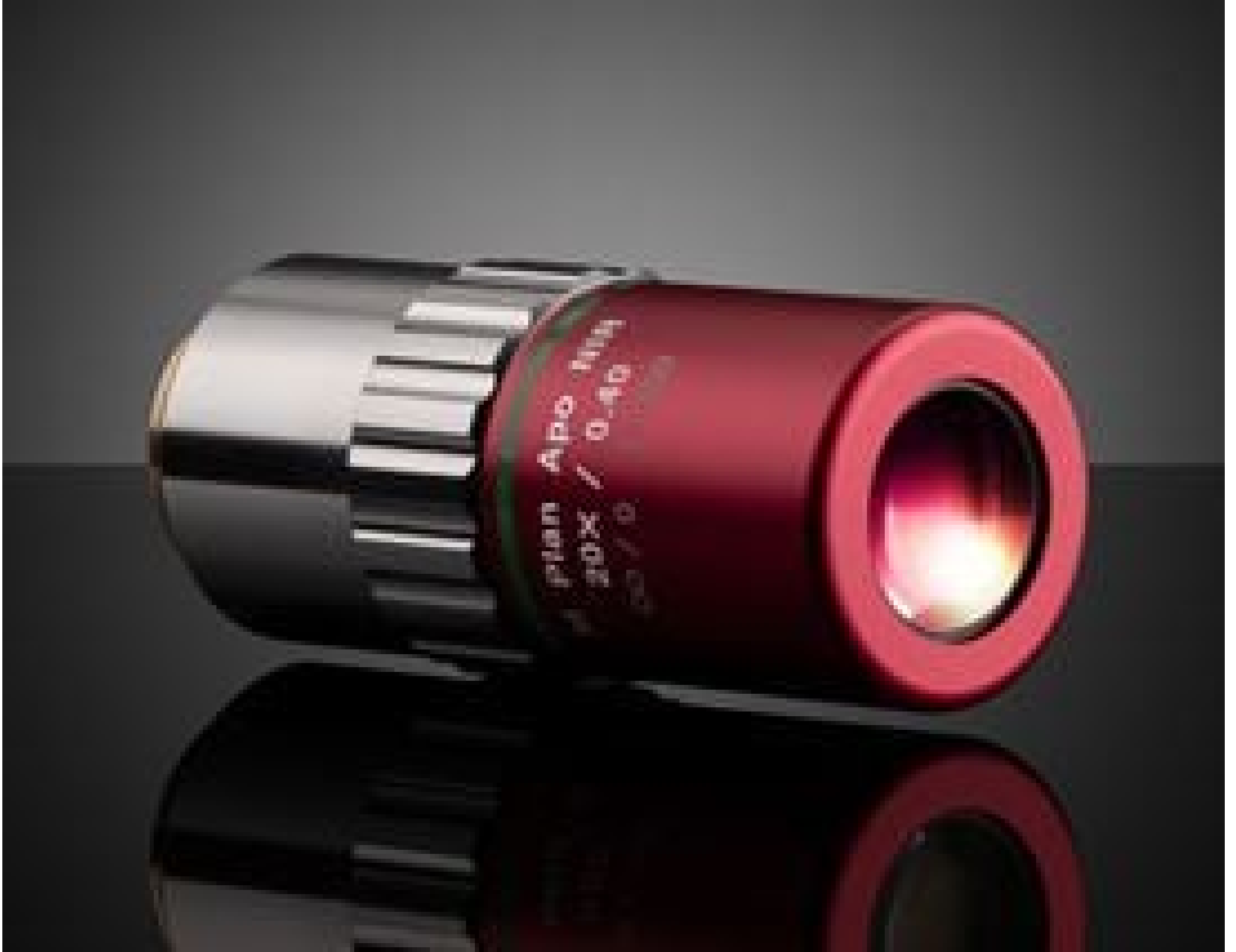
20X Mitutoyo Plan Apo NIR Infinity Corrected Objective, #46-404