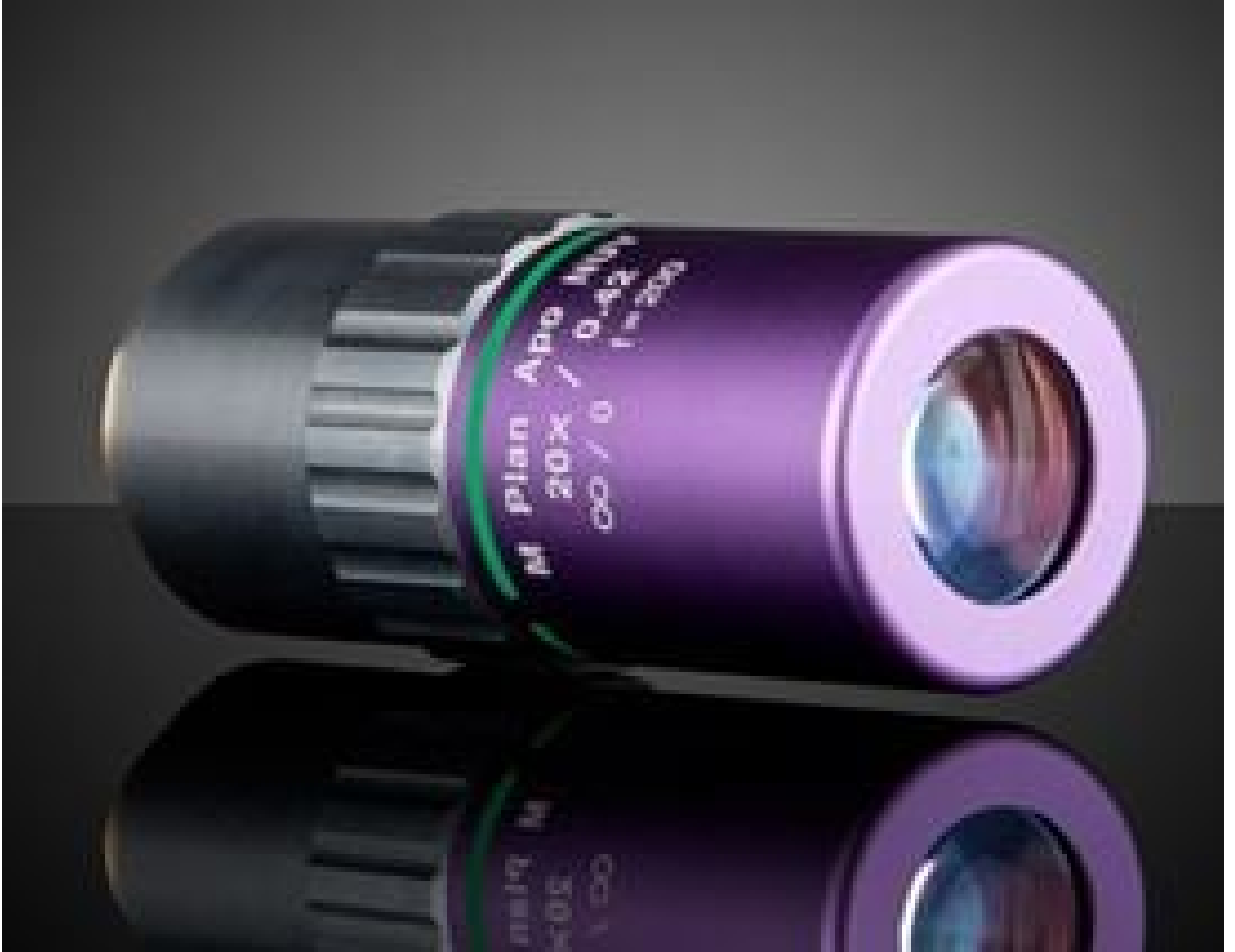
20X Mitutoyo Plan Apo NUV Infinity Corrected Objective, #46-407