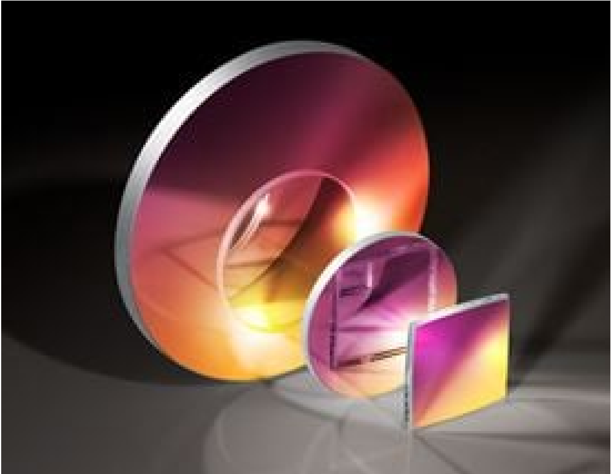
4-6λ First Surface Mirrors