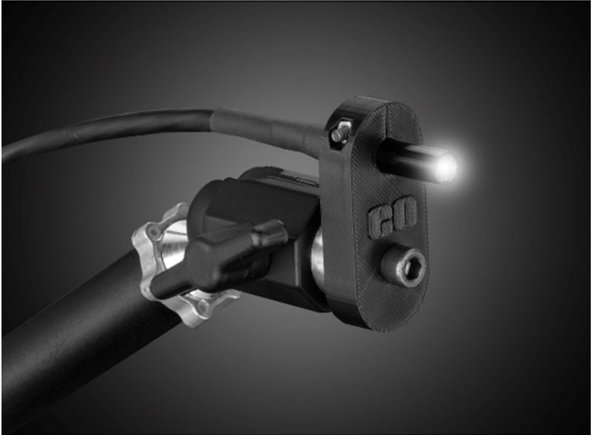
Spot Light Configuration