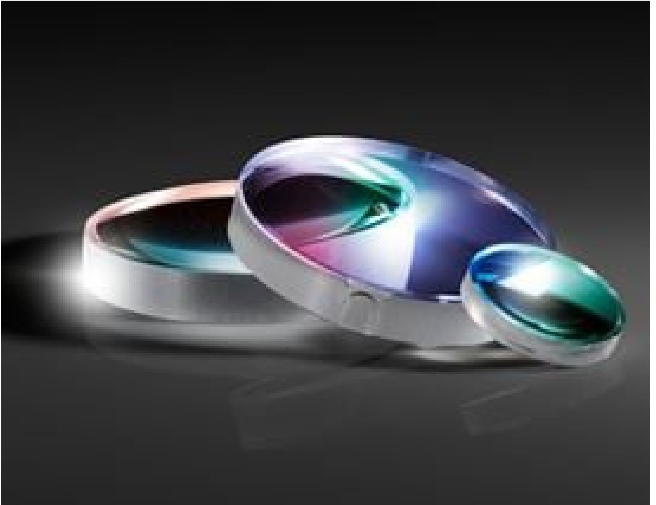
Molded Acrylic Aspheric Lenses