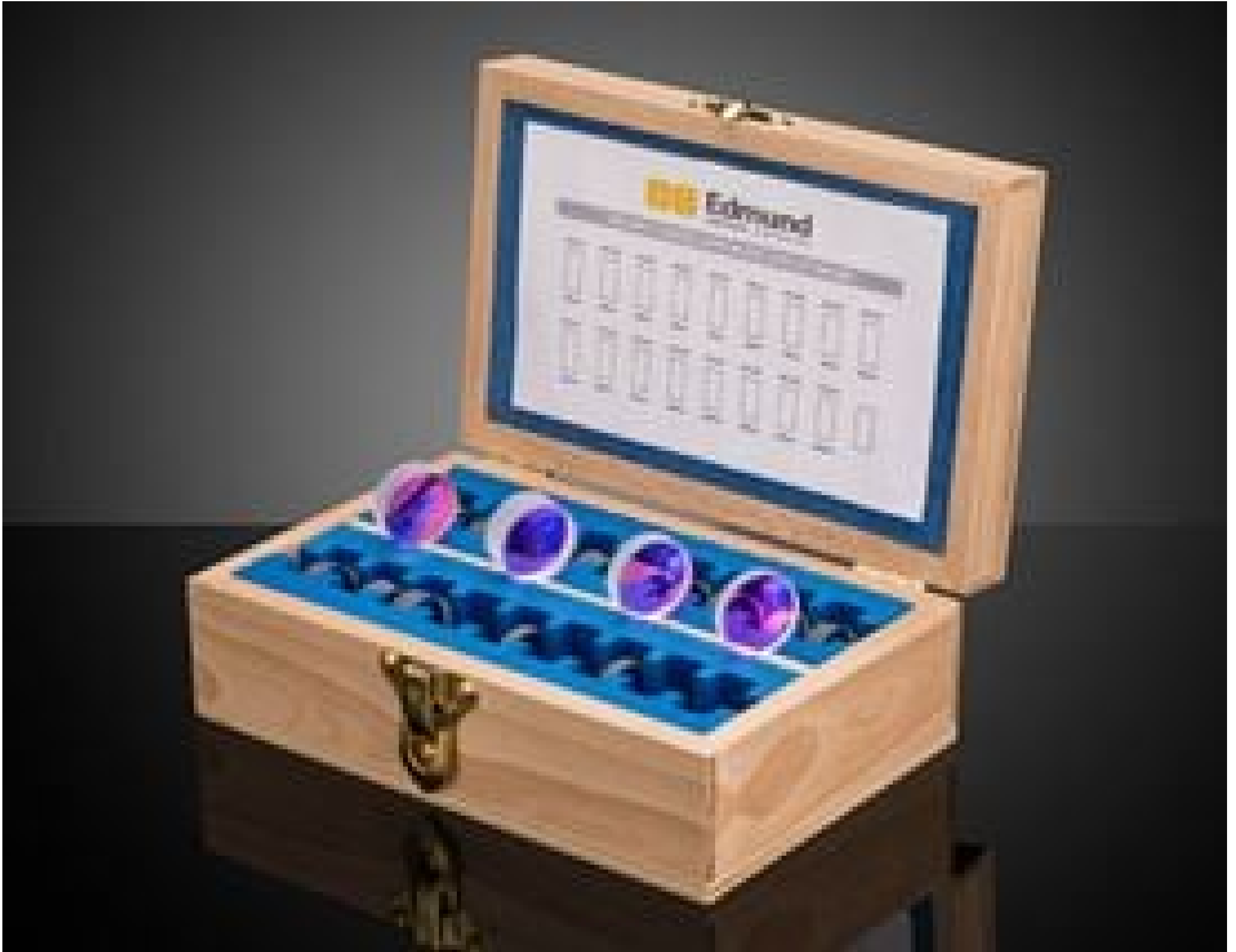
Achromatic Lens Kit