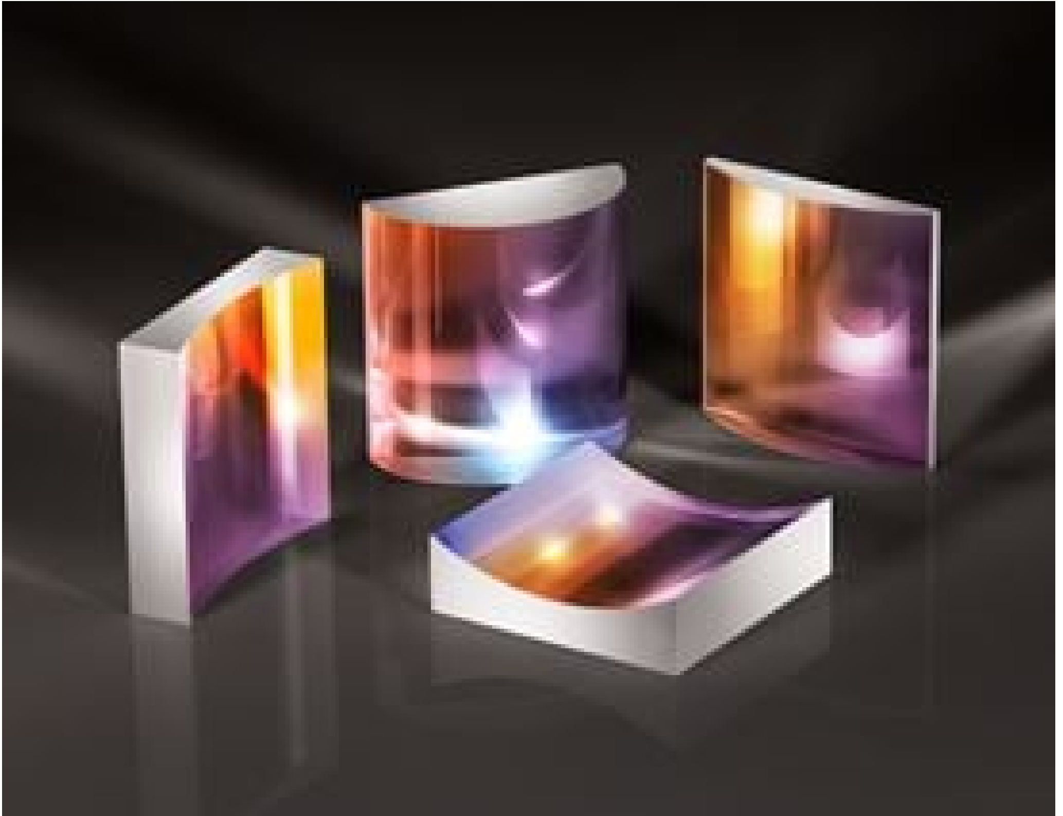
TECHSPEC Beam Shaping Fused Silica Cylinder Lenses