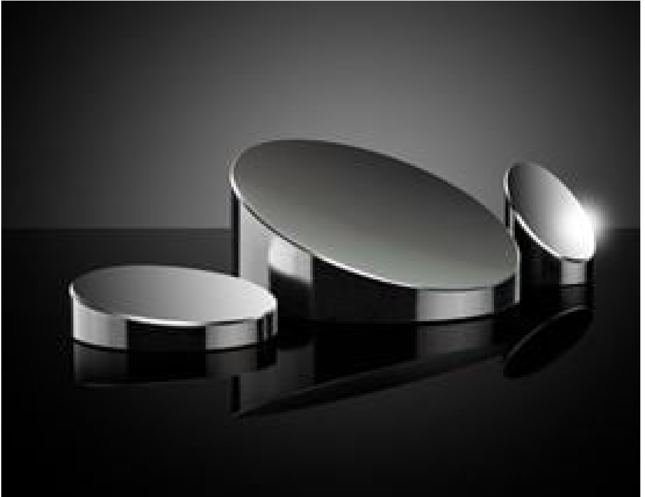
TECHSPEC Aluminum Off-Axis Parabolic Mirrors